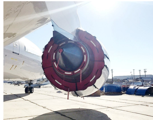
Boeing 787 Dreamliner Bypass Vent, Turbine Exhaust, & Exhaust Nozzle Plugs, Genx Engines