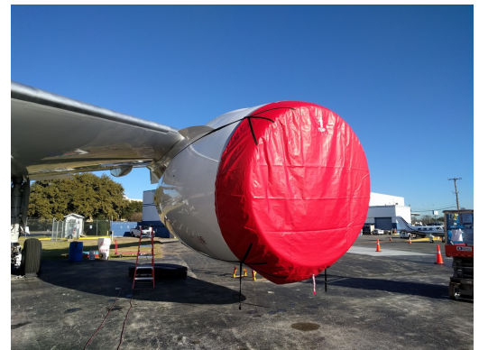
Boeing 787 Intake Cover