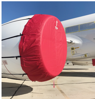
Boeing 787 Dreamliner Intake Covers Kit, Oem Type, Each, Boeing P/N: K10011-1 (Equals Qty 2 Of K10011-2), Adjustable Straps To Bypass Attachment Detail