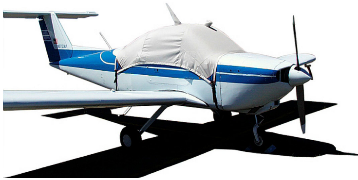
Canopy Cover for Beech Skipper

Travel Covers are made with Silver Solution-Dyed Polyester fabric and only lined over the windshield to save weight. The material is lightweight and more compact for easy stowage in the aircraft. The polyester material is water resistant, but only intended for occasional use outside. We also have an ultra lightweight material available for fitted hangar dust covers. For daily outdoor use, the non-travel Sunbrella Cover is the best choice.