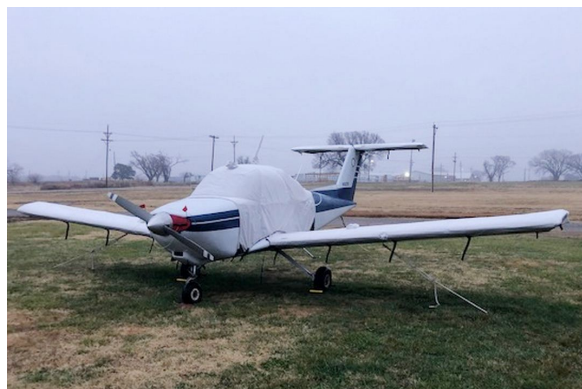
Beech Skipper Extended Canopy Cover, Wing & Horiz. Stab. Covers