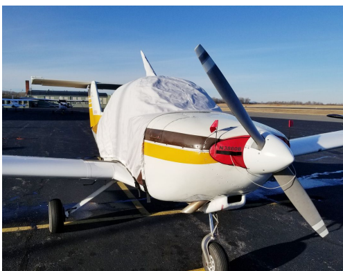
Beech Skipper Extended Canopy Cover and Inlet Plugs

This cover type is made from Silver Acrylic Sunbrella canvas and is 100% lined with a soft and smooth microfiber. Bruce's Custom Covers developed this material combination especially for aircraft protection. The outer material is medium weight and treated for water resistance, UV resistance and anti-static buildup. The inner lining is a very soft and smooth microfiber to prevent scratching. The material is very reflective, and tests show that the cabin interior temperature can be reduced to near-ambient temperature on the hottest of days. It is water, ice and snow repellent, yet breathable to allow moisture to escape from between the cover and the aircraft surface.