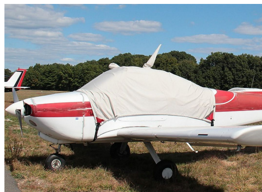
Beech B77 Skipper Canopy Cover