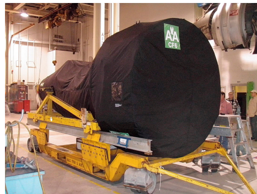
GE CF6 Series Off-Link Engine Shipper Cover, w/ Exhaust Cone, Fully enclosed