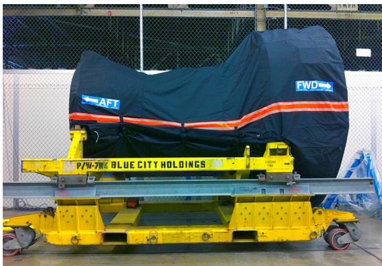
PW JT9D Series Off-Link Engine Transport Cover, Fully Enclosed, P/N: PW-120

FABRIC & THREAD: For strength, durability and ease of use we make these covers of the heaviest nylon ballistic cloth. It is sewn in multiple courses with Tenara thread, and reinforced with heavy vinyl cloth at high-wear points.