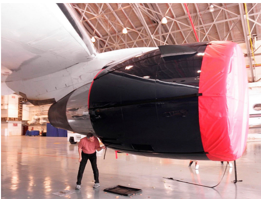
Boeing 767 Intake Covers Ship Set

FABRIC & THREAD: For strength, durability and ease of use we make these covers of the heaviest nylon ballistic cloth. It is sewn in multiple courses with Tenara thread, and reinforced with heavy vinyl cloth at high-wear points.