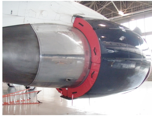
Grumman Gulfstream G-V Rosemont/TAT Cover Boeing 767 Exhaust Plugs Ship Set, incl. Fan Thrust Reverser and Exhaust Plugs P/N: B767-200