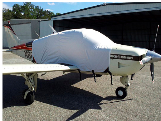
Beech Sport Extended Canopy Cover