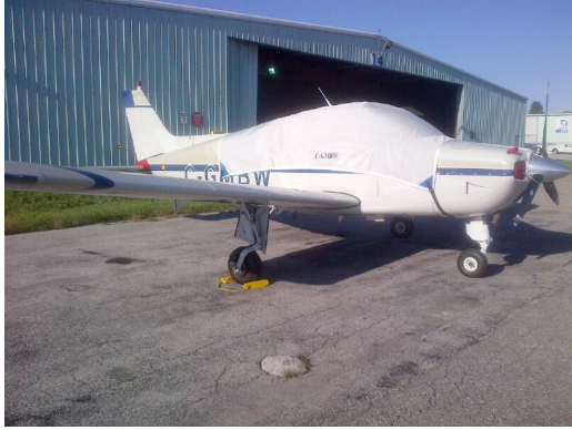
Beech Sierra Canopy Cover, Engine Plugs, Tailcone Cover

plugs are imprinted with the aircraft registration number in black for an extra charge. Storage bag NOT included. Engine plugs may be inserted after flight when the engine is still warm. Engine Inlet Plugs are commonly referred to as Cowl Plugs, Intake Plugs, Cowl Blocks, Engine Blocks, and Engine Bungs.