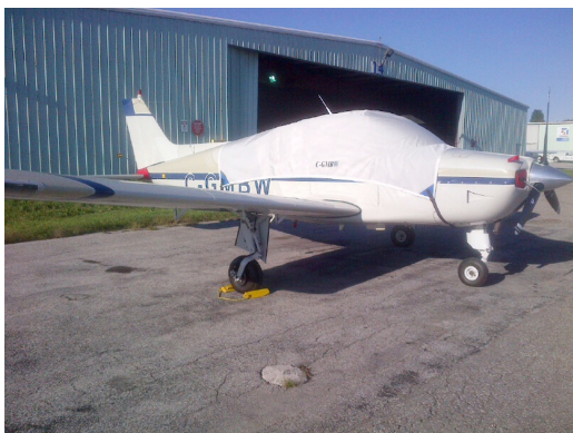
Beech Sierra Canopy Cover, Engine Plugs, Tailcone Cover

This cover type is made from Silver Acrylic Sunbrella canvas and is 100% lined with a soft and smooth microfiber. Bruce's Custom Covers developed this material combination especially for aircraft protection. The outer material is medium weight and treated for water resistance, UV resistance and anti-static buildup. The inner lining is a very soft and smooth microfiber to prevent scratching. The material is very reflective, and tests show that the cabin interior temperature can be reduced to near-ambient temperature on the hottest of days. It is water, ice and snow repellent, yet breathable to allow moisture to escape from between the cover and the aircraft surface.