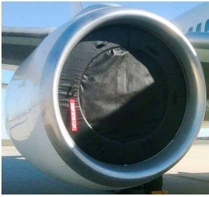
Boeing 757 Intake Plugs, RB.211 Engine (Comes in colors)