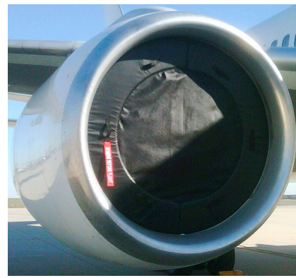
Boeing 757 Intake Plugs, RB.211 Engine (Comes in colors)