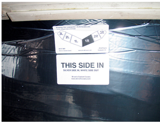
Boeing 757 Cockpit HeatShield set, installation detail