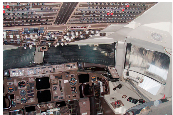
Boeing 757 Cockpit HeatShield set