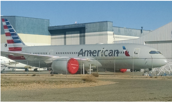
Boeing 787 Intake Covers