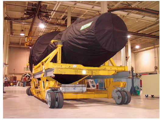
QEC Off-link Engine Cover / Tarp / Bag