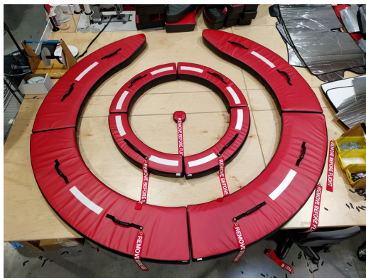
Boeing 747-8 Exhaust Plugs