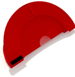
Airbus A330 Intake Plug, framed bi-fold type