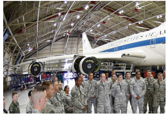
BOEING E-4B INTAKE COVERS