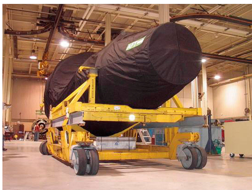
QEC Off-link Engine Cover / Tarp / Bag