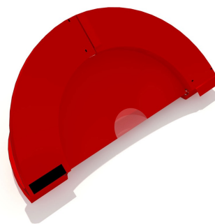
Airbus A330 Intake Plug, framed bi-fold type