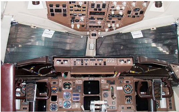
Boeing Cockpit HeatShield set

Heatshield is an excellent short-term remedy for cockpit overheating, but an external fabric cover is more effective for long-term protection.