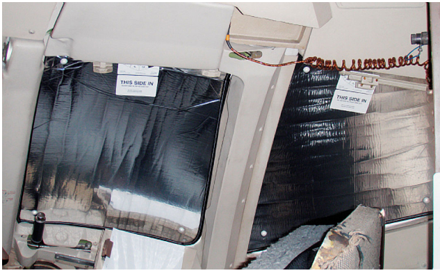
Boeing 757 Cockpit HeatShield set