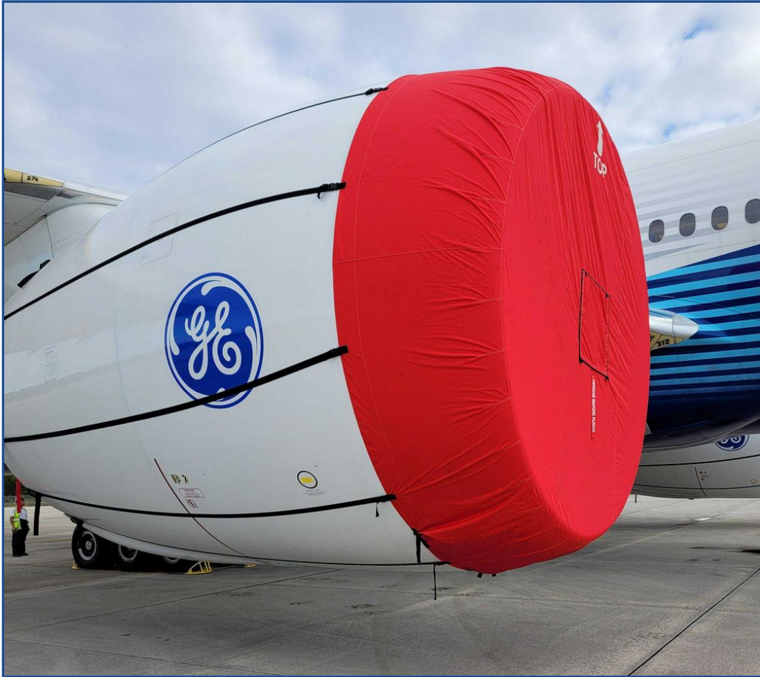
Boeing 747 Intake Covers, GE Engines