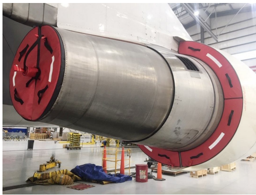
Boeing 747 Bypass Vent & Turbine Exhaust Pugs