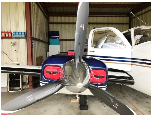
Beech Baron 58 Engine Inlet Plugs & Cowl Top Plugs

Engine Inlet Plugs are custom fit for your Beech Baron 58, G58 intakes, made with heavy-duty vinyl material, and stuffed with a single block of sculpted urethane foam. Each plug has a zipper that allows the foam to be removed and dried if necessary. Engine plugs have warning flags that are visible from the cockpit or 'remove before flight' streamers sewn onto the face of the plugs. Most plugs are imprinted with the aircraft registration number in black for an extra charge. Storage bag NOT included. Engine plugs may be inserted after flight when the engine is still warm. Engine Inlet Plugs are commonly referred to as Cowl Plugs, Intake Plugs, Cowl Blocks, Engine Blocks, and Engine Bungs.