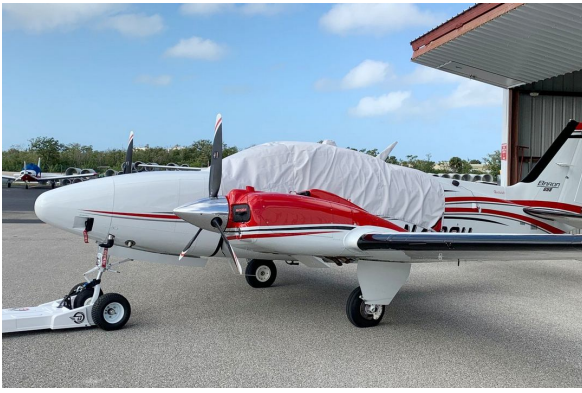
Beech Baron G58 Canopy Cover