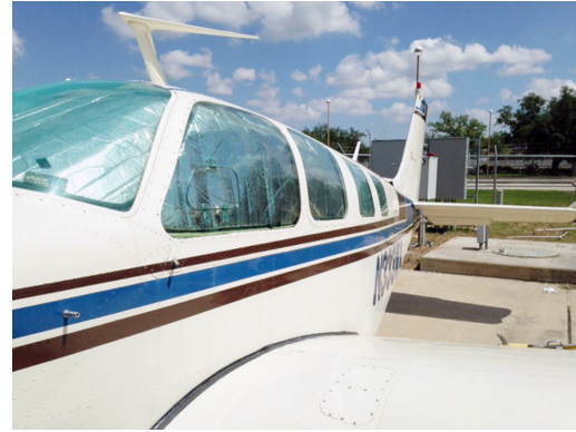
Beech Bonanza Heatshield Set