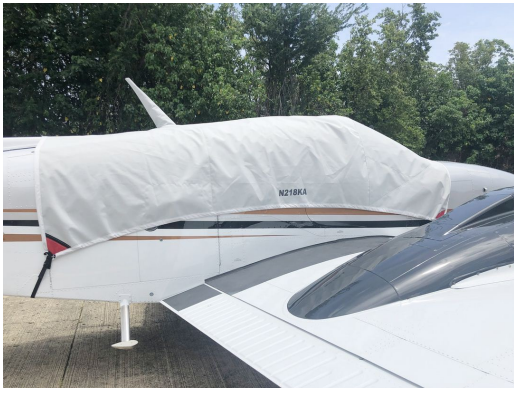
Baron G58 Travel Cover