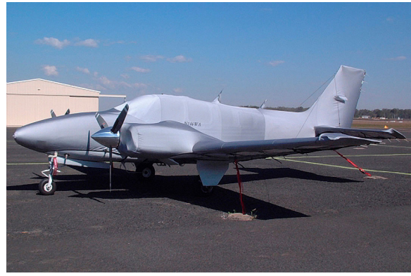
Baron FULL COVER SET, Light Weight Travel &/or Fitted Dust Cover Set