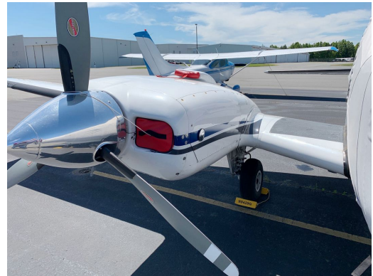
Beech Baron 58 Engine Plugs