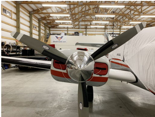
Beech Baron 58 Engine Inlet Plugs

Engine Inlet Plugs are custom fit for your Beech Baron 58, G58 intakes, made with heavy-duty vinyl material, and stuffed with a single block of sculpted urethane foam. Each plug has a zipper that allows the foam to be removed and dried if necessary. Engine plugs have warning flags that are visible from the cockpit or 'remove before flight' streamers sewn onto the face of the plugs. Most plugs are imprinted with the aircraft registration number in black for an extra charge. Storage bag NOT included. Engine plugs may be inserted after flight when the engine is still warm. Engine Inlet Plugs are commonly referred to as Cowl Plugs, Intake Plugs, Cowl Blocks, Engine Blocks, and Engine Bungs.