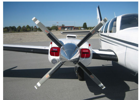
Baron 58 Engine Plugs