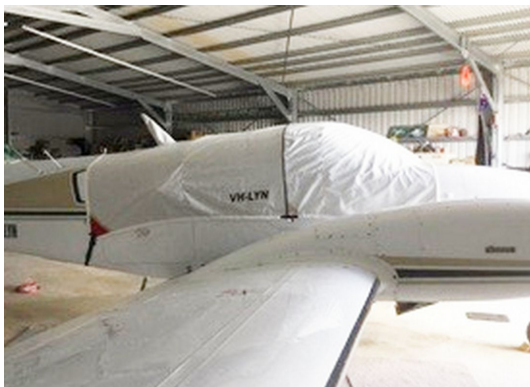
Beech Baron B-55 Canopy Cover

This cover type is made from Silver Acrylic Sunbrella canvas and is 100% lined with a soft and smooth microfiber. Bruce's Custom Covers developed this material combination especially for aircraft protection. The outer material is medium weight and treated for water resistance, UV resistance and anti-static buildup. The inner lining is a very soft and smooth microfiber to prevent scratching. The material is very reflective, and tests show that the cabin interior temperature can be reduced to near-ambient temperature on the hottest of days. It is water, ice and snow repellent, yet breathable to allow moisture to escape from between the cover and the aircraft surface.