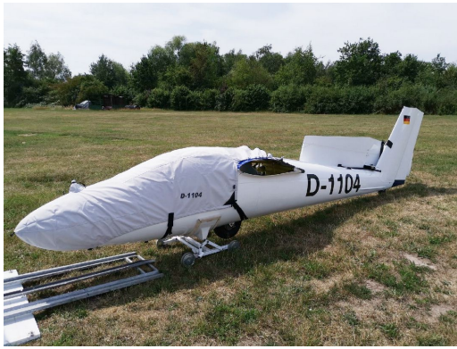
Pilatus B-4 Canopy/Nose Cover