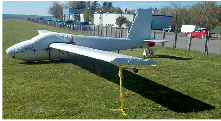
SGS 1-26B Canopy/Nose, Empennage & Wing Covers