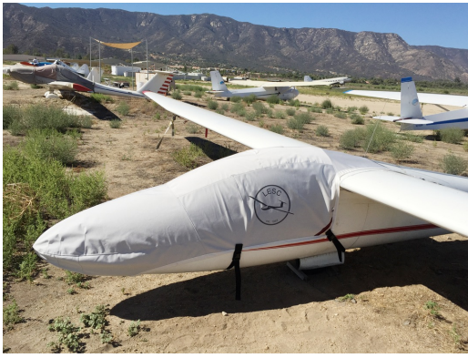
Pilatus B4 Canopy/Nose Cover