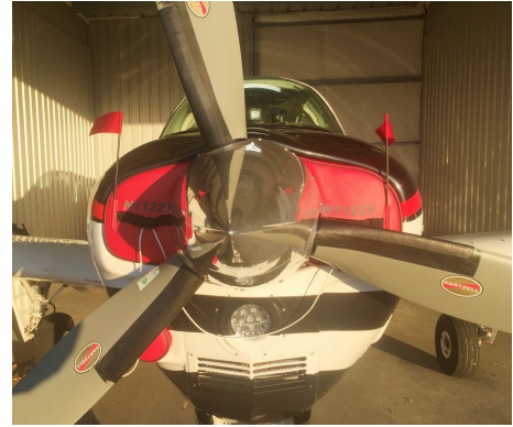
Beech B36TC Tornado Alley Turbo Plug