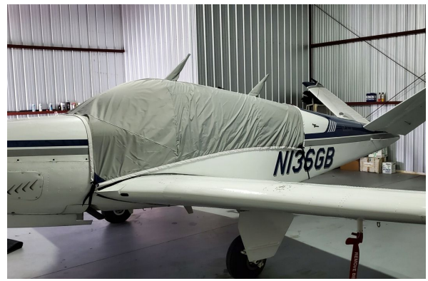
Beech Bonanza Travel Weight Canopy Cover