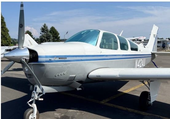
Beech Bonanza F33A Windshield HeatShield

Windshield Heatshields are interior sunshades for an aircraft's front windshield. The product is a unique composite of closed-cell foam with a silver mylar finish. The semi-rigid design is stiff enough to stand along the inside of the windshield using sun visors or window framing. It folds up flat and easily stores in the included storage sleeve. Some designs may require velcro and suction cups or split right and left sides. A Heatshield is an excellent short-term remedy for cockpit overheating. An external fabric cover is far more effective and practical for long-term protection.