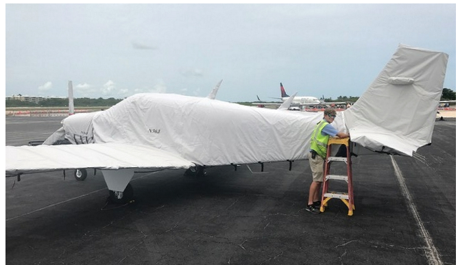
Bonanza G36 Full Cover Set