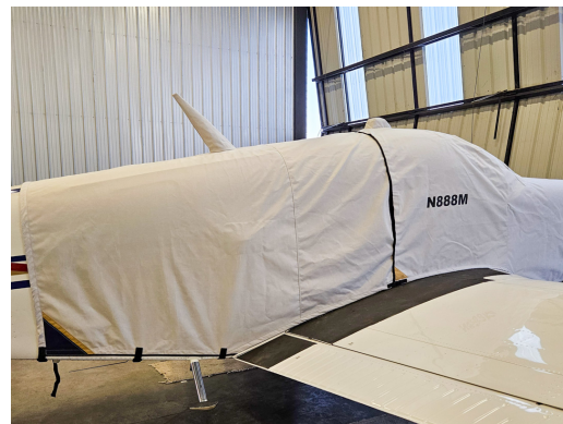
Beech Bonanza 36 Models Extended Canopy/Engine Cover, Belly Strap Type