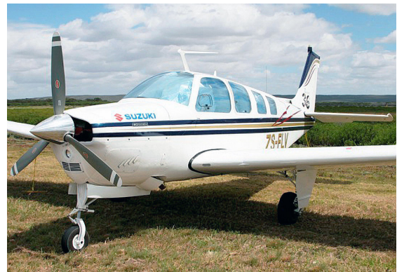
Bonanza A36 HeatShield Set