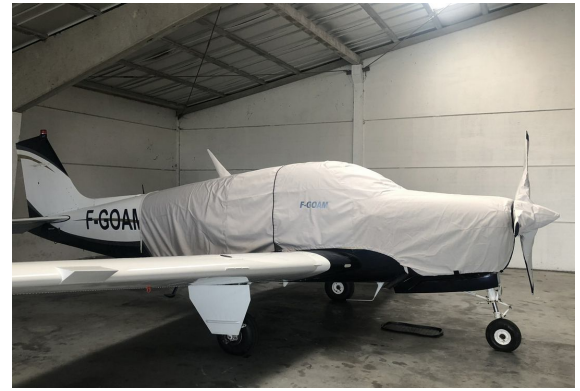
Beech Bonanza A-36 Extended Canopy/Engine Cover, 3-Blade Prop Cover