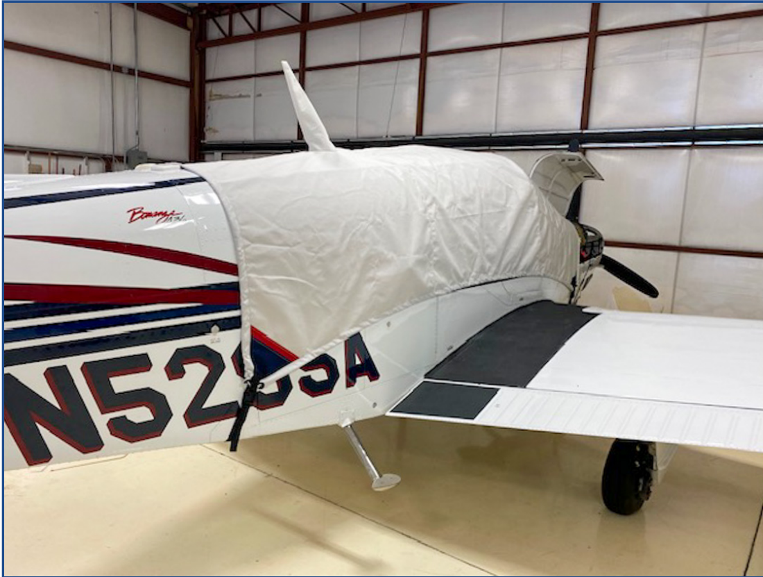
Beech Bonanza 36 Models Canopy Cover