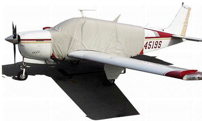
A36 Bonanza Extended Canopy Cover

This cover type is made from Silver Acrylic Sunbrella canvas and is 100% lined with a soft and smooth microfiber. Bruce's Custom Covers developed this material combination especially for aircraft protection. The outer material is medium weight and treated for water resistance, UV resistance and anti-static buildup. The inner lining is a very soft and smooth microfiber to prevent scratching. The material is very reflective, and tests show that the cabin interior temperature can be reduced to near-ambient temperature on the hottest of days. It is water, ice and snow repellent, yet breathable to allow moisture to escape from between the cover and the aircraft surface.