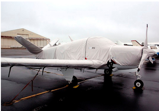
Beech Bonanza Full Cover Set

WINTER USE MATERIAL - Made with Solution-Dyed Polyester fabric, this option is intended for seasonal use to aid in deicing, rain mitigation, or for occasional travel. The material is lighter and more compact, but more susceptible to UV damage and may have a shorter useful life if used continuously outside than the all-year use material.