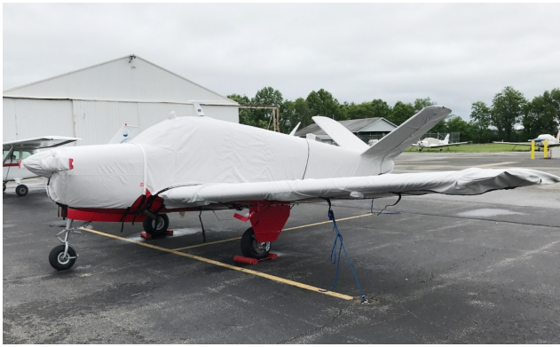
Beech Bonanza/Debonair Extended Canopy Cover (Specify Lg Or Sm Windshield & Lg Or Sm 3rd Window)