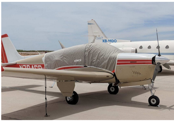
Beech Bonanza F33A Light Weight Travel Cover