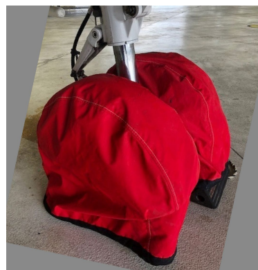
Beech King Air 300 Tire Covers (main gear)