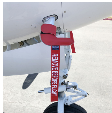
Beech King Air Pitot Covers