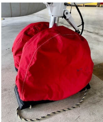
Beech King Air 300 Tire Covers (main gear)

ALL-YEAR USE MATERIAL - Made with Silver Acrylic Sunbrella canvas, the all-year use material is the best option for sun protection and cover longevity. This heavier more durable material is intended for all weather conditions, such as rain and snow or lots of sun.