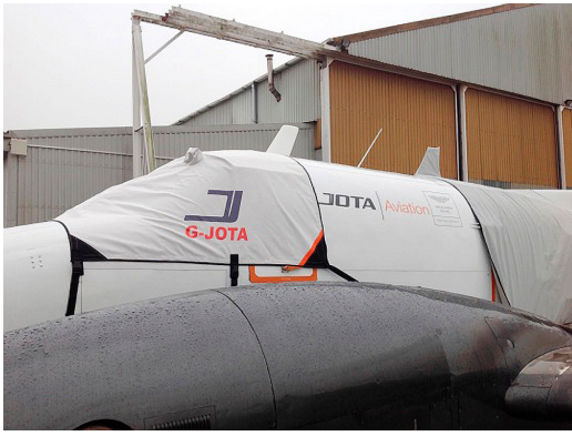
King Air Windshield/Cockpit Cover