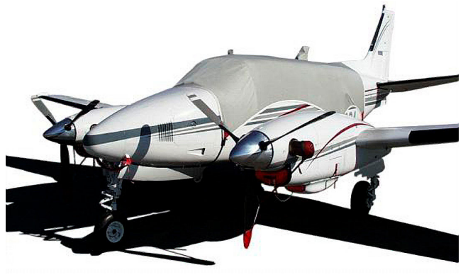
King Air Canopy Cover, Engine Plugs, Prop-Tie/Exhaust Covers