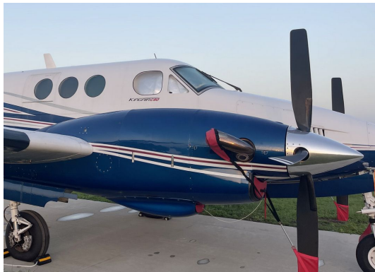
Beech King Air C90 Cockpit HeatShields