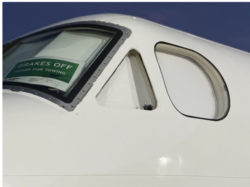
Beechcraft B200 Cockpit Heatshields

Cockpit Heatshields are interior sunshades for the aircraft's cockpit. The product is a unique composite of closed-cell foam with a silver mylar finish. The semi-rigid design is stiff enough to stand inside the window framing. The set folds up flat and is easily stored in the included storage sleeve. Some designs may require velcro and suction cups. A Heatshield is an excellent short-term remedy for cockpit overheating, but an external fabric cover is more effective for long-term protection.