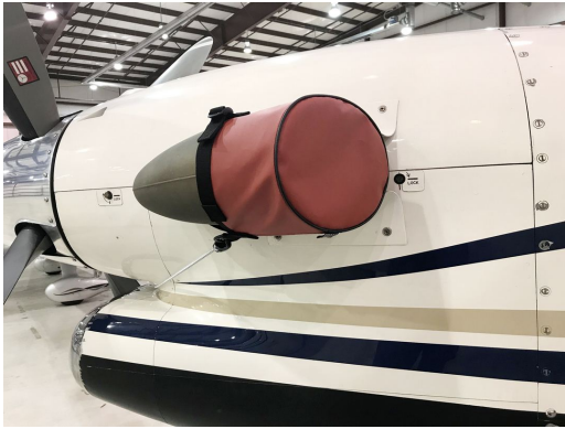
Beech King Air 350 Exhaust Covers

water resistance, UV resistance and anti-static buildup. The inner lining is a very soft and smooth microfiber to prevent scratching. The material is very reflective, and tests show that the cabin interior temperature can be reduced to near-ambient temperature on the hottest of days. It is water, ice and snow repellent, yet breathable to allow moisture to escape from between the cover and the aircraft surface.