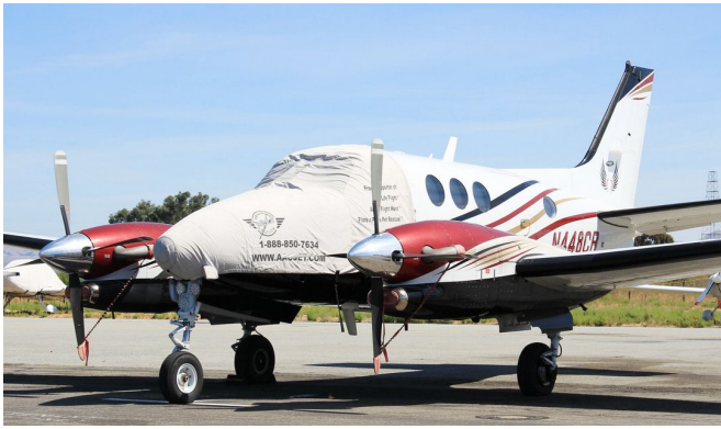
King Air Cockpit/Nose