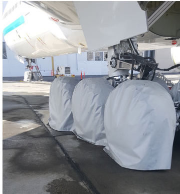
Boeing 777 Main & Nose Gear Tire Covers

ALL-YEAR USE MATERIAL - Made with Silver Acrylic Sunbrella canvas, the all-year use material is the best option for sun protection and cover longevity. This heavier more durable material is intended for all weather conditions, such as rain and snow or lots of sun.