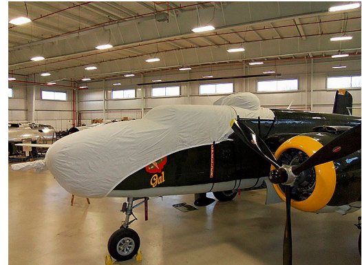
B25 Cockpit/Nose and Gun Turret Covers