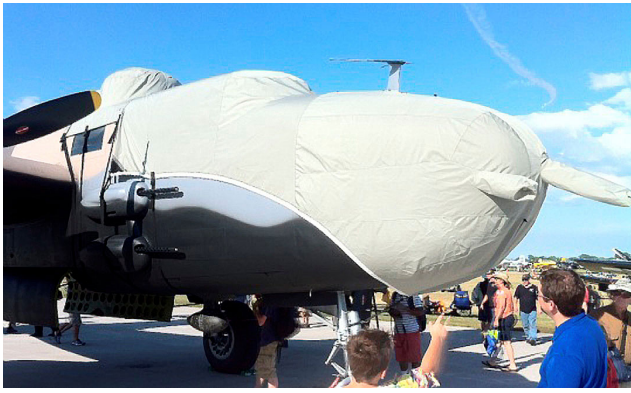
B25 Cockpit/Nose and Gun Turret Covers