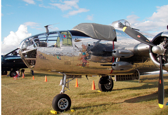
Mitchell B25 Cockpit Cover (Snap-On Type)

This cover type is made from Silver Acrylic Sunbrella canvas and is 100% lined with a soft and smooth microfiber. Bruce's Custom Covers developed this material combination especially for aircraft protection. The outer material is medium weight and treated for water resistance, UV resistance and anti-static buildup. The inner lining is a very soft and smooth microfiber to prevent scratching. The material is very reflective, and tests show that the cabin interior temperature can be reduced to near-ambient temperature on the hottest of days. It is water, ice and snow repellent, yet breathable to allow moisture to escape from between the cover and the aircraft surface.