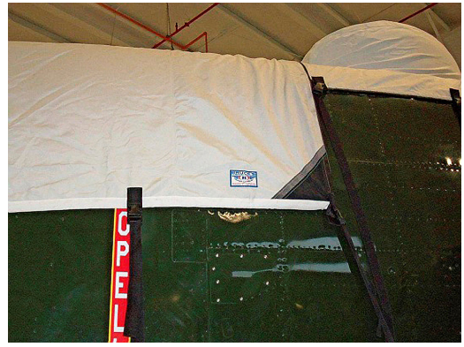
B25 Gun Turret Cover