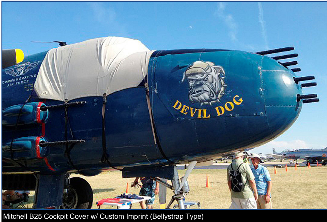
Mitchell B25 Cockpit Cover w/ Custom Imprint (Bellystrap Type)