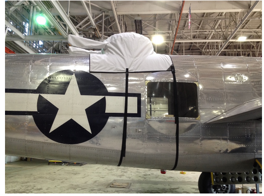
B25 Gun Turret Cover