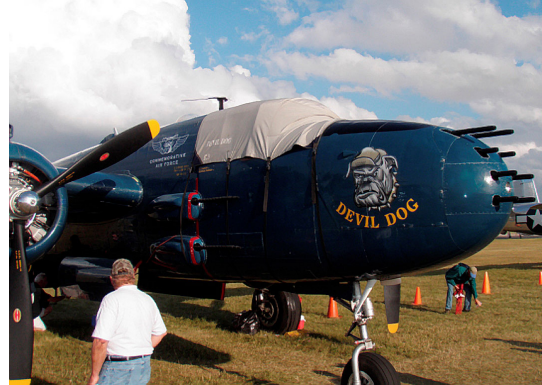
Mitchell B25 Cockpit Cover w/ Custom Imprint (Bellystrap Type)