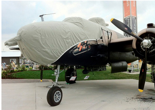
B25 Cockpit/Nose and Gun Turret Covers

This cover type is made from Silver Acrylic Sunbrella canvas and is 100% lined with a soft and smooth microfiber. Bruce's Custom Covers developed this material combination especially for aircraft protection. The outer material is medium weight and treated for water resistance, UV resistance and anti-static buildup. The inner lining is a very soft and smooth microfiber to prevent scratching. The material is very reflective, and tests show that the cabin interior temperature can be reduced to near-ambient temperature on the hottest of days. It is water, ice and snow repellent, yet breathable to allow moisture to escape from between the cover and the aircraft surface.