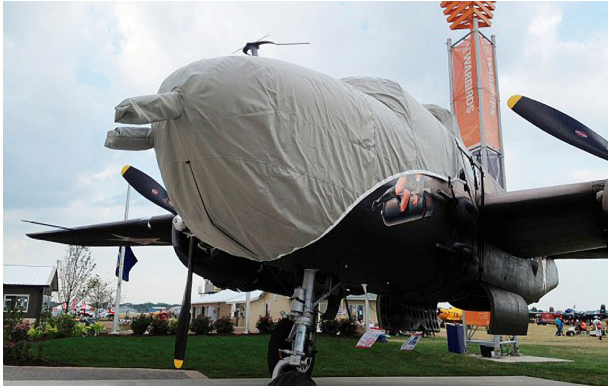
B25 Cockpit/Nose and Gun Turret Covers