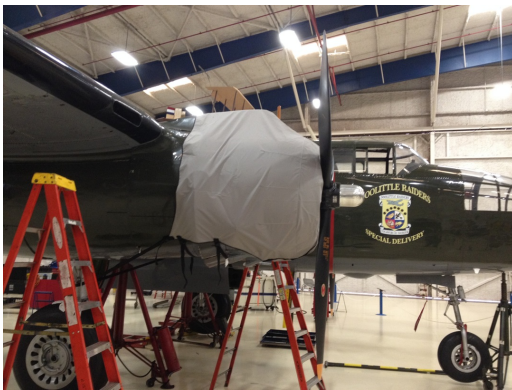
B25 Engine Cover

Engine Covers will cinch around or behind the spinner, cover the entire engine cowl area including the engine air cooling and induction air inlets, and fastens together with Velcro beneath the spinner down the front of the cowling. The Engine Cover is attached with a belly strap aft of the firewall, and can Velcro to the Canopy Cover. Engine Covers are normally made from Solution-Dyed Polyester or Acrylic Sunbrella . An Insulated version of the engine cover can be made with a thicker, quilted, and water-repellent material. The Insulated Engine Cover works well in cold climates to help with engine preheating.