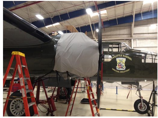
B25 Engine Cover