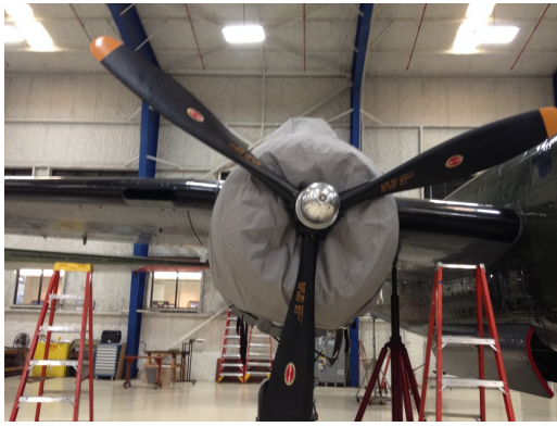
B25 Engine Cover