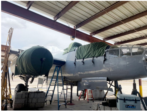
Mitchell B25 Cockpit, Turret & Engine Covers