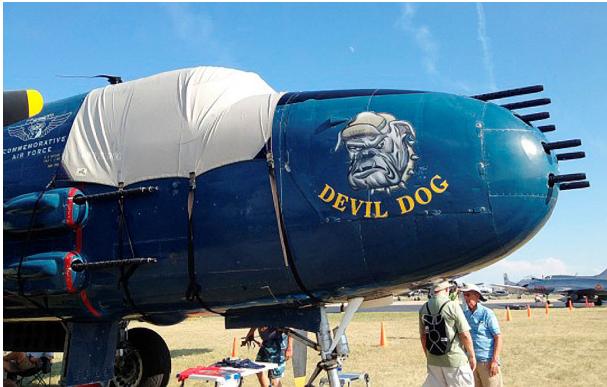
Mitchell B25 Cockpit Cover w/ Custom Imprint (Bellystrap Type)