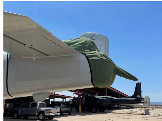
Mitchell B25 Tail Gunner Cover