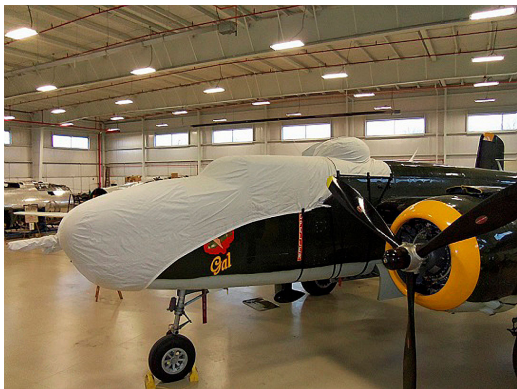
B25 Cockpit/Nose and Gun Turret Covers