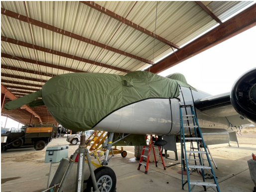
Mitchell B25 Cockpit/Nose Cover, & Turret Cover

This cover type is made from Silver Acrylic Sunbrella canvas and is 100% lined with a soft and smooth microfiber. Bruce's Custom Covers developed this material combination especially for aircraft protection. The outer material is medium weight and treated for water resistance, UV resistance and anti-static buildup. The inner lining is a very soft and smooth microfiber to prevent scratching. The material is very reflective, and tests show that the cabin interior temperature can be reduced to near-ambient temperature on the hottest of days. It is water, ice and snow repellent, yet breathable to allow moisture to escape from between the cover and the aircraft surface.