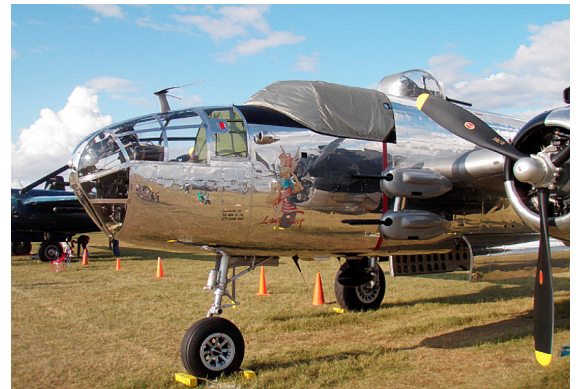
Mitchell B25 Cockpit Cover (Snap-On Type)