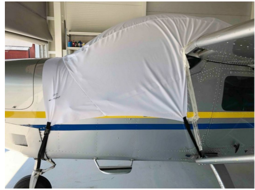
Saab Safari Canopy Cover, test fit cover