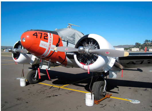
Beech 18 Cockpit Cover and Carb Air Inlet Plugs

This cover type is made from Silver Acrylic Sunbrella canvas and is 100% lined with a soft and smooth microfiber. Bruce's Custom Covers developed this material combination especially for aircraft protection. The outer material is medium weight and treated for water resistance, UV resistance and anti-static buildup. The inner lining is a very soft and smooth microfiber to prevent scratching. The material is very reflective, and tests show that the cabin interior temperature can be reduced to near-ambient temperature on the hottest of days. It is water, ice and snow repellent, yet breathable to allow moisture to escape from between the cover and the aircraft surface.