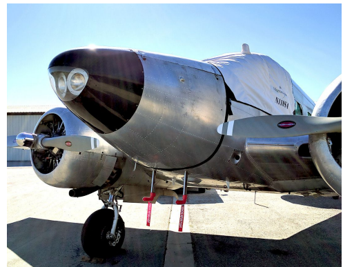
Beech Super 18 Cockpit Cover