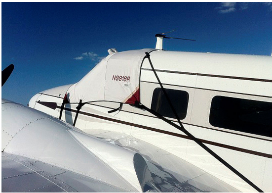
Beech 18 Cockpit Cover