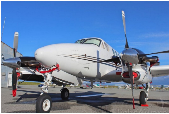
King Air C90A Engine Plugs and Pitot Covers