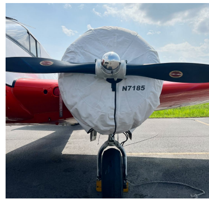
Beech 18 Engine Covers, non-insulated