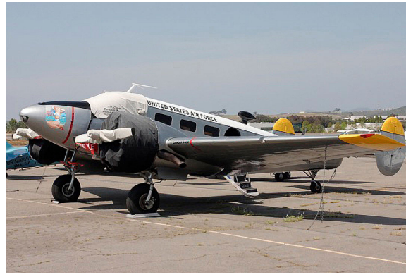
Twin Beech 18 Cockpit, Engine & Prop Covers