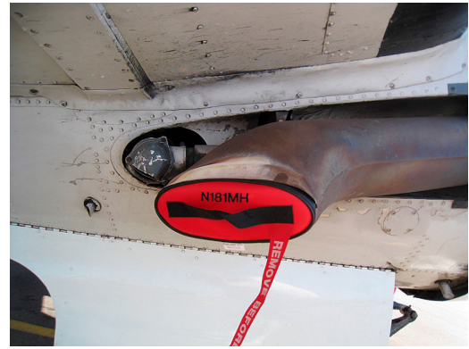
Beech 18 Exhaust Plugs