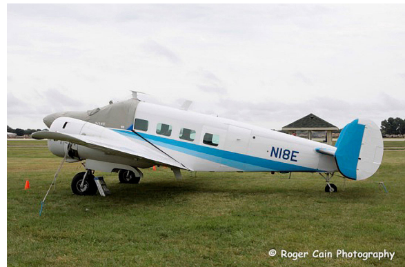
Twin Beech 18 Cockpit/Nose Cover