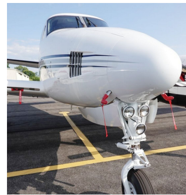
Beech King Air C90 Pitot Covers, Heat Exchanger Plugs