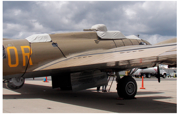
B-17 Canopy/Gun Turret Cover & Hatch Cover