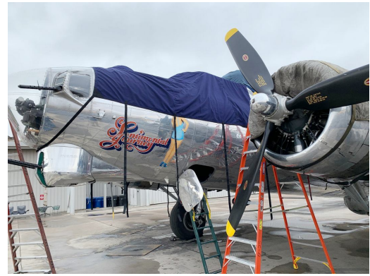
Boeing B-17 Canopy Cover