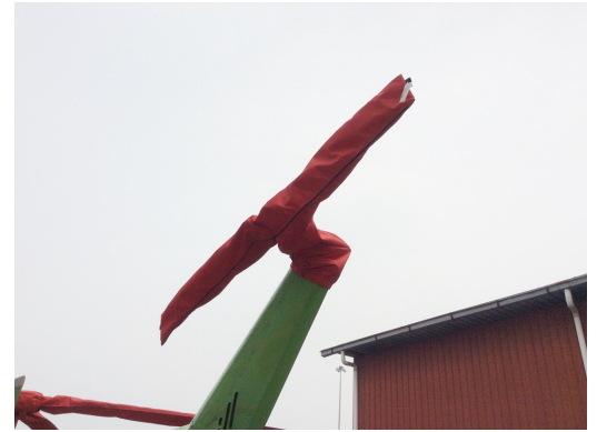
MBB BO-105 Tail Rotor Covers