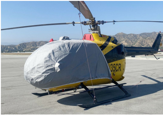
Eurocopter BO-105 Bubble Cover, Standard Model