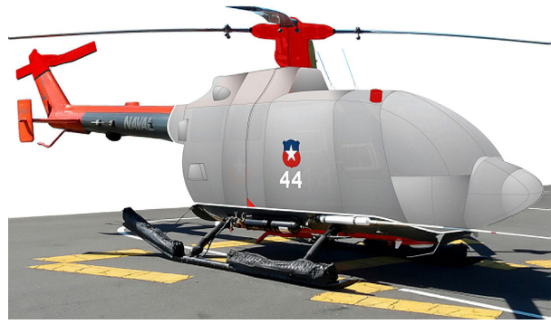
MBB BO-105 Full Body, Rotor Mast & Tail Rotor Covers (illustration)