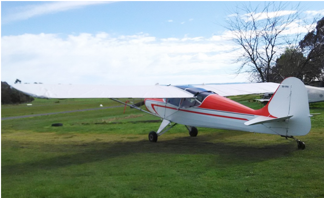
Auster J5 Autocar Wing Covers