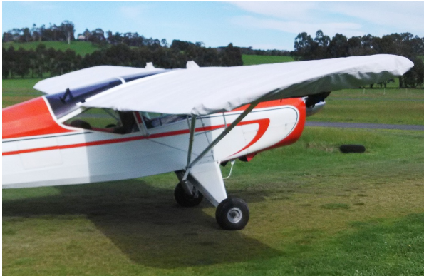
Auster J5 Autocar Wing Covers

WINTER USE MATERIAL - Made with Solution-Dyed Polyester fabric, this option is intended for seasonal use to aid in deicing, rain mitigation, or for occasional travel. The material is lighter and more compact, but more susceptible to UV damage and may have a shorter useful life if used continuously outside than the all-year use material.