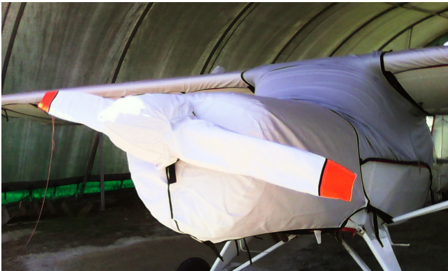
Auster J5 Canopy, Engine, and Propellor Covers