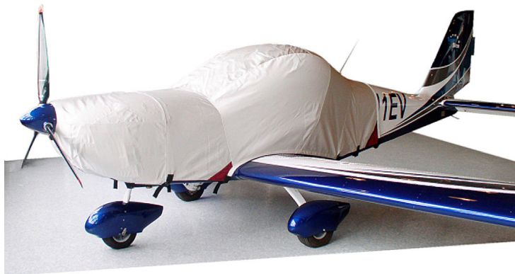
Ekvator Sportstar Extended Canopy/Engine Cover

This cover type is made from Silver Acrylic Sunbrella canvas and is 100% lined with a soft and smooth microfiber. Bruce's Custom Covers developed this material combination especially for aircraft protection. The outer material is medium weight and treated for water resistance, UV resistance and anti-static buildup. The inner lining is a very soft and smooth microfiber to prevent scratching. The material is very reflective, and tests show that the cabin interior temperature can be reduced to near-ambient temperature on the hottest of days. It is water, ice and snow repellent, yet breathable to allow moisture to escape from between the cover and the aircraft surface.