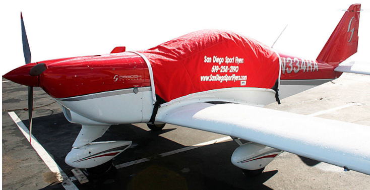
Gobosh Canopy Cover with custom Imprint

This cover type is made from Silver Acrylic Sunbrella canvas and is 100% lined with a soft and smooth microfiber. Bruce's Custom Covers developed this material combination especially for aircraft protection. The outer material is medium weight and treated for water resistance, UV resistance and anti-static buildup. The inner lining is a very soft and smooth microfiber to prevent scratching. The material is very reflective, and tests show that the cabin interior temperature can be reduced to near-ambient temperature on the hottest of days. It is water, ice and snow repellent, yet breathable to allow moisture to escape from between the cover and the aircraft surface.