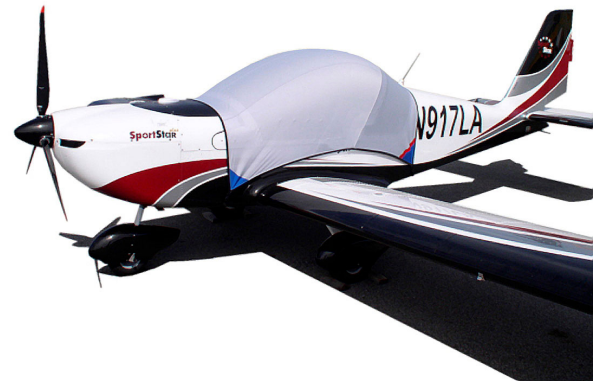
Evektor Sportstar Light Weight Travel-Cover