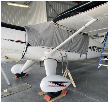
Consolidated Vultee V-77 Travel Cover