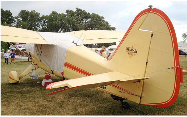
Stinson Reliant Over-the-top Canopy Cover