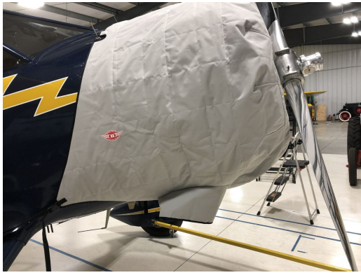
Stinson Reliant SR-10 Insulated Engine Cover