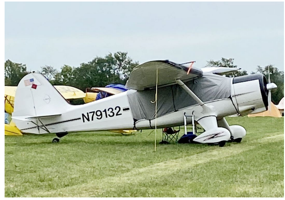
Consolidated Vultee V-77 Travel Cover