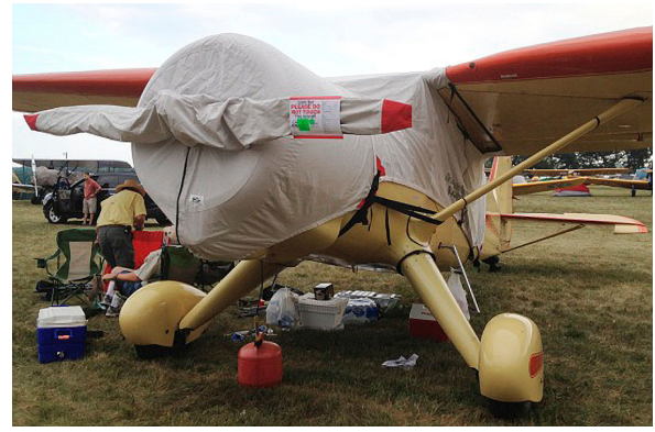
Stinson Reliant Over-the-top Canopy, Engine, and Propeller Cover