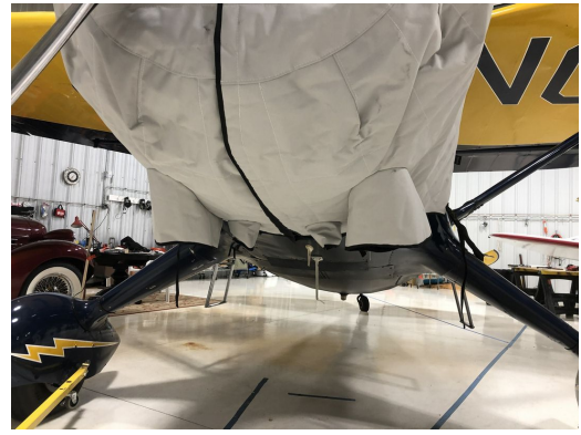
Stinson Reliant SR-10 Insulated Engine Cover