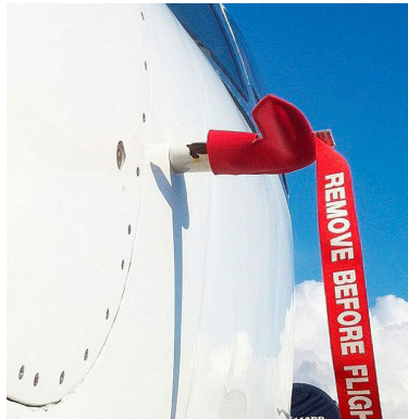
Westwind 1125 Astra Pitot Cover, Heat Resistant Type

The Engine Inlet Plugs are custom fit for your Israel Aircraft Industries Astra (C-38) intakes, made with heavy-duty vinyl material, and stuffed with a single block of sculpted urethane foam. Each plug has a zipper that allows the foam to be removed and dried if necessary. Engine plugs have 'remove before flight' streamers sewn onto the face of the plugs. Most plugs are imprinted with the aircraft registration number in black for an extra charge. Storage bag NOT included. Engine plugs may be inserted after flight when the engine is still warm. Engine Inlet Plugs are commonly referred to as Cowl Plugs, Intake Plugs, Cowl Blocks, Engine Blocks, and Engine Bungs.