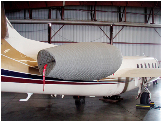
IAI Westwind 1124 Insulated Engine Nacelle Cover