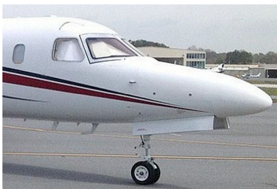
IAI Astra Cockpit Heatshields

Windshield Heatshields are interior sunshades for an aircraft's front windshield. The product is a unique composite of closed-cell foam with a silver mylar finish. The semi-rigid design is stiff enough to stand along the inside of the windshield using sun visors or window framing. It folds up flat and easily stores in the included storage sleeve. Some designs may require velcro and suction cups. Our Heatshields are offered white side out since aircraft manufacturers have issued advisories against reflective window inserts due to potential heat damage. A Heatshield is an excellent short-term remedy for cockpit overheating, but an external fabric cover is more effective for long-term protection.