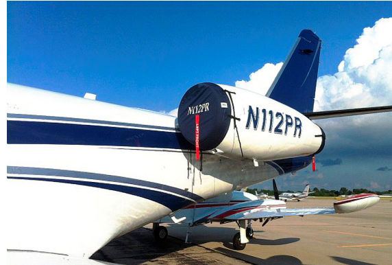
Westwind 1125 Astra Engine Intake/Exhaust Covers Set