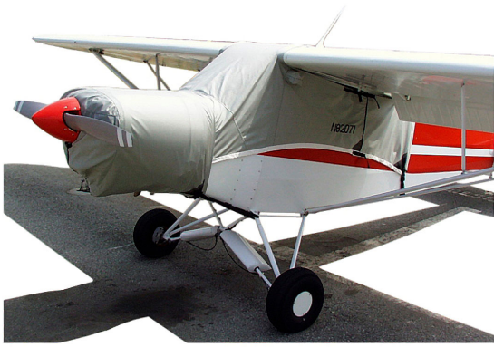
Piper PA-18 Super Cub Canopy & Engine Covers