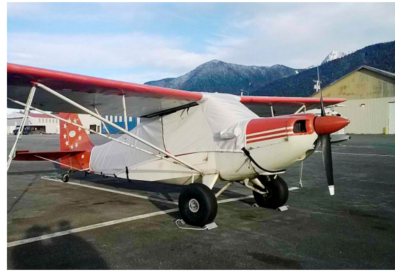
Bellanca Citabria Over-Top Canopy Cover, extended to tail