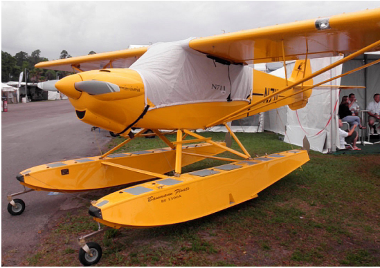
Cub Crafters Carbon Cub Canopy Cover

Travel Covers are made with Silver Solution-Dyed Polyester fabric and only lined over the windshield to save weight. The material is lightweight and more compact for easy stowage in the aircraft. The polyester material is water resistant, but only intended for occasional use outside. We also have an ultra lightweight material available for fitted hangar dust covers. For daily outdoor use, the non-travel Sunbrella Cover is the best choice.