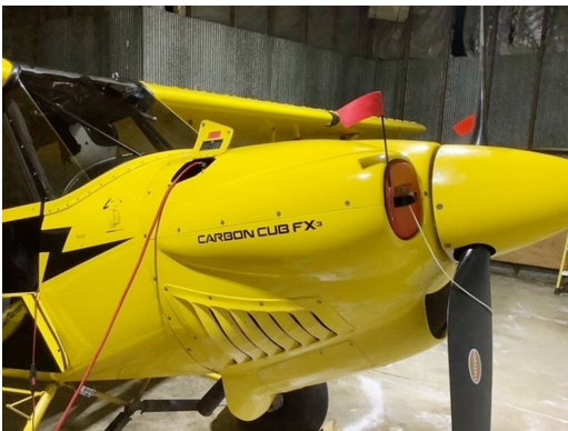
Cub Crafters CCX-2000 Engine Plugs

Engine Inlet Plugs are custom fit for your Lewaero Ascender intakes, made with heavy-duty vinyl material, and stuffed with a single block of sculpted urethane foam. Each plug has a zipper that allows the foam to be removed and dried if necessary. Engine plugs have warning flags that are visible from the cockpit or 'remove before flight' streamers sewn onto the face of the plugs. Most plugs are imprinted with the aircraft registration number in black for an extra charge. Storage bag NOT included. Engine plugs may be inserted after flight when the engine is still warm. Engine Inlet Plugs are commonly referred to as Cowl Plugs, Intake Plugs, Cowl Blocks, Engine Blocks, and Engine Bungs.