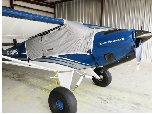
Cub Crafters Carbon Cub Travel Weight Canopy Cover