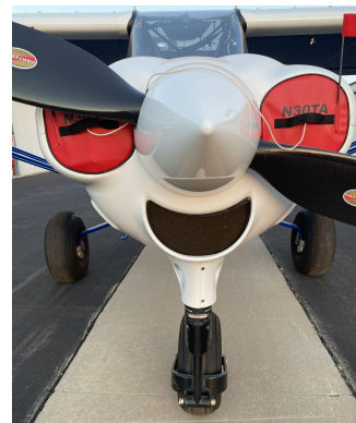
CubCrafters CC-18, 19, 20, Top Cub, CCK-1865, CC-19 X-Cub, CCX-2000, EX-3, FX-3 Engine Inlet Plugs