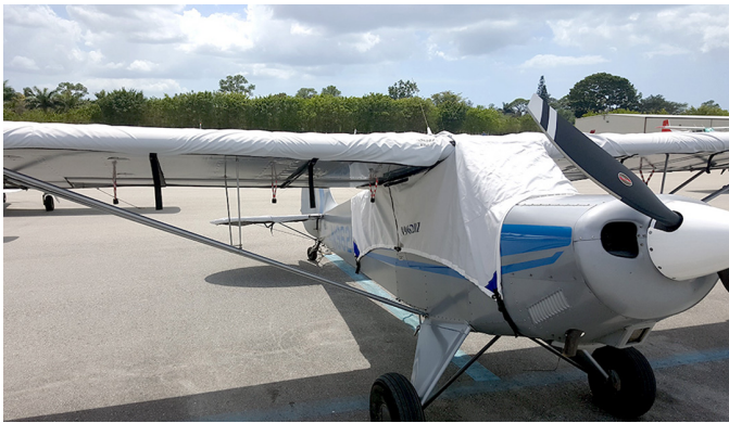
Aviat (Christen) Husky Canopy Cover (Over-The-Top Style)

WINTER USE MATERIAL - Made with Solution-Dyed Polyester fabric, this option is intended for seasonal use to aid in deicing, rain mitigation, or for occasional travel. The material is lighter and more compact, but more susceptible to UV damage and may have a shorter useful life if used continuously outside than the all-year use material.