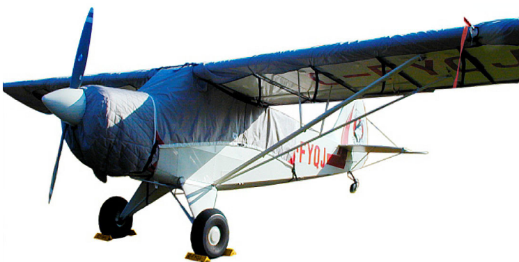
Aviat Husky Insulated Engine Cover, Canopy & Wing Covers