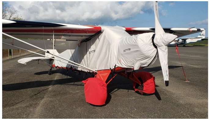
Aviat Husky Extended Canopy Cover, Engine, Prop, Empennage & Tire Covers