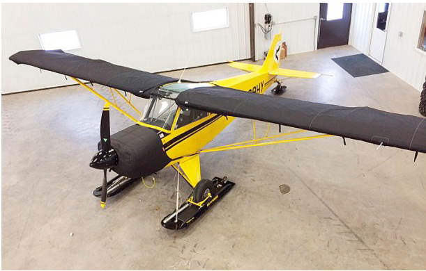
Aviat Husky Insulated Engine Cover, Wing Covers