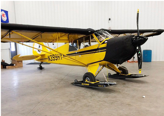
Aviat Husky Insulated Engine Cover, Wing Covers

WINTER USE MATERIAL - Made with Solution-Dyed Polyester fabric, this option is intended for seasonal use to aid in deicing, rain mitigation, or for occasional travel. The material is lighter and more compact, but more susceptible to UV damage and may have a shorter useful life if used continuously outside than the all-year use material.