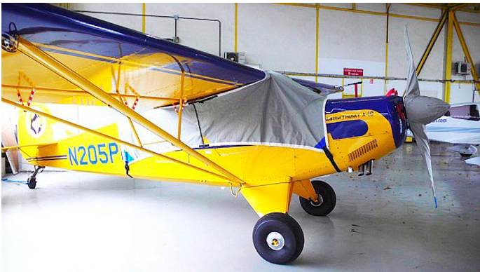
Aviat Husky Canopy & Prop Covers

This cover type is made from Silver Acrylic Sunbrella canvas and is 100% lined with a soft and smooth microfiber. Bruce's Custom Covers developed this material combination especially for aircraft protection. The outer material is medium weight and treated for water resistance, UV resistance and anti-static buildup. The inner lining is a very soft and smooth microfiber to prevent scratching. The material is very reflective, and tests show that the cabin interior temperature can be reduced to near-ambient temperature on the hottest of days. It is water, ice and snow repellent, yet breathable to allow moisture to escape from between the cover and the aircraft surface.