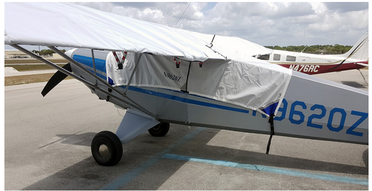
Aviat (Christen) Husky Wing Covers, All Year Use