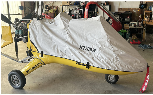
American Ranger AR-1 Gyrocopter Canopy/Nose Cover