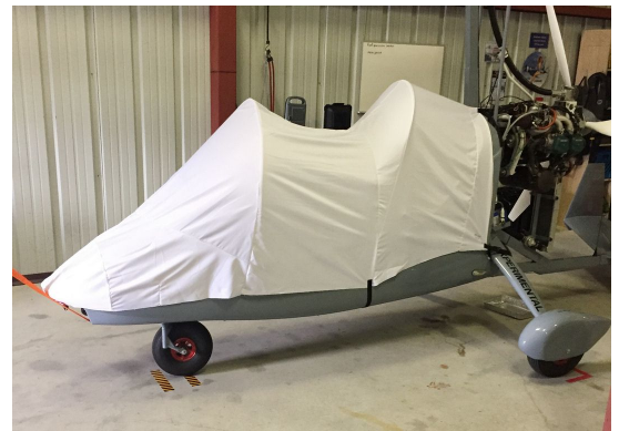
Magni M16 Autogyro Canopy/Nose Cover, test fit cover