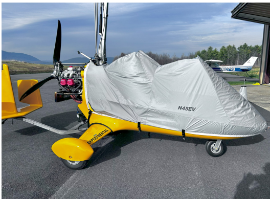
AR1 American Ranger Gyrocopter Travel Cover, Lightweight Canopy/Nose Cover

Travel Covers are made with Silver Solution-Dyed Polyester fabric and fully lined over the entire cover. The material is lightweight and more compact for easy storage in the aircraft. The polyester material is water resistant, but only intended for occasional use outside. We also have an ultra lightweight material available for fitted hangar dust covers. For daily outdoor use, the non-travel Sunbrella Cover is the best choice.