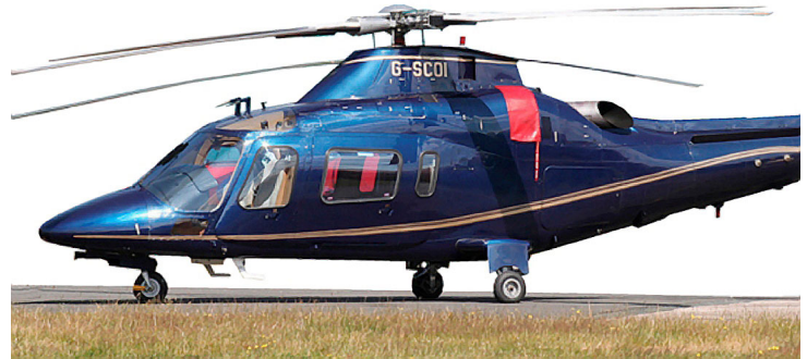
Agusta Power Intake Cover