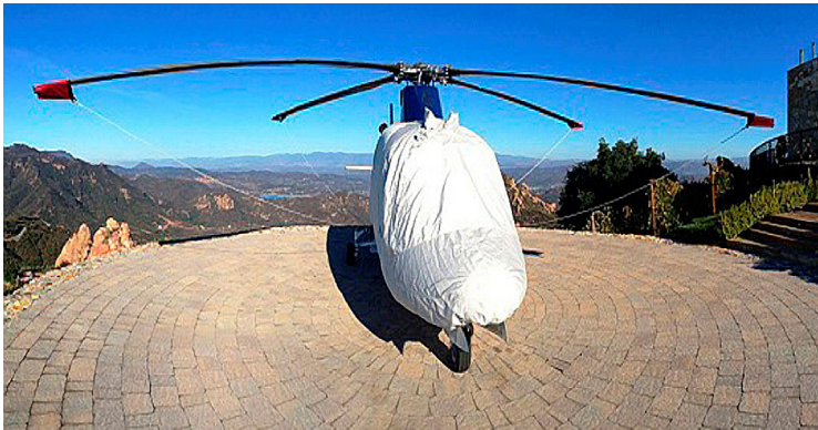
Agusta 109 Mk II+ Bubble Cover and Blade Tie-downs

WINTER USE MATERIAL - Made with Solution-Dyed Polyester fabric, this option is intended for seasonal use to aid in deicing, rain mitigation, or for occasional travel. The material is lighter and more compact, but more susceptible to UV damage and may have a shorter useful life if used continuously outside than the all-year use material.