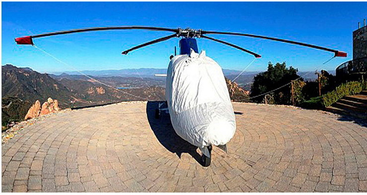
Agusta 109 Mk II+ Bubble Cover and Blade Tie-downs