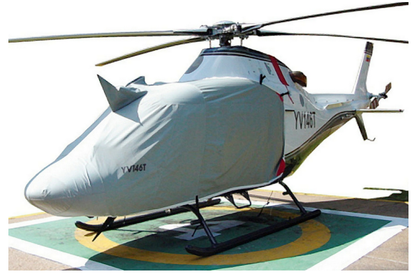
Koala Bubble Cover (with Wire Strike)