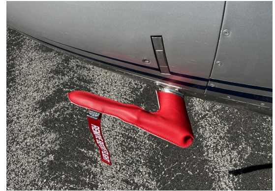
Agusta AW109 (A, C, & Trekker) Pitot Cover Set