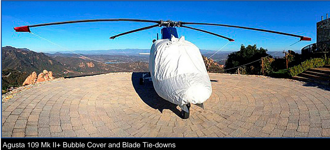
Agusta 109 Mk II+ Bubble Cover and Blade Tie-downs