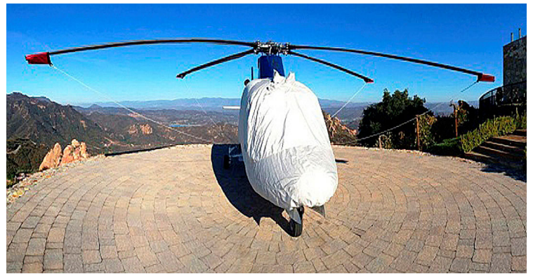
Agusta 109 Mk II+ Bubble Cover and Blade Tie-downs