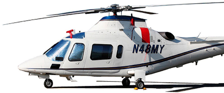
Agusta Power Pitot Covers, Intake Covers, and Cockpit Heatshield set

aircraft registration number in black for an extra charge. Storage bag NOT included. Engine plugs may be inserted after flight when the engine is still warm. Engine Inlet Plugs are commonly referred to as Cowl Plugs, Intake Plugs, Cowl Blocks, Engine Blocks, and Engine Bunges.