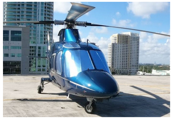
Agusta AW109 Power, A109E Heatshield Set