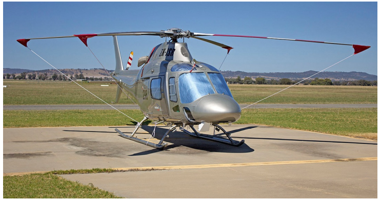
Agusta 119 Cockpit/Cabin HeatShields