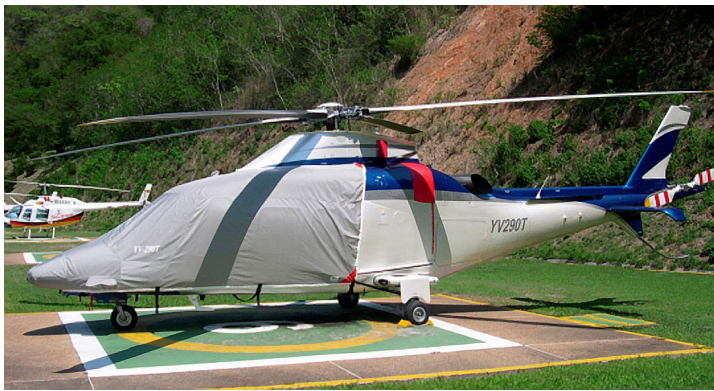
Agusta Grand Bubble Cover

Travel Covers are made with Silver Solution-Dyed Polyester fabric and fully lined over the entire cover. The material is lightweight and more compact for easy storage in the aircraft. The polyester material is water resistant, but only intended for occasional use outside. We also have an ultra lightweight material available for fitted hangar dust covers. For daily outdoor use, the non-travel Sunbrella Cover is the best choice.