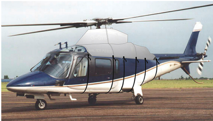
Agusta Power Engine Cover (illustration)

WINTER USE MATERIAL - Made with Solution-Dyed Polyester fabric, this option is intended for seasonal use to aid in deicing, rain mitigation, or for occasional travel. The material is lighter and more compact, but more susceptible to UV damage and may have a shorter useful life if used continuously outside than the all-year use material.