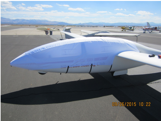
DG-505 Canopy/Nose Cover (test fit cover)