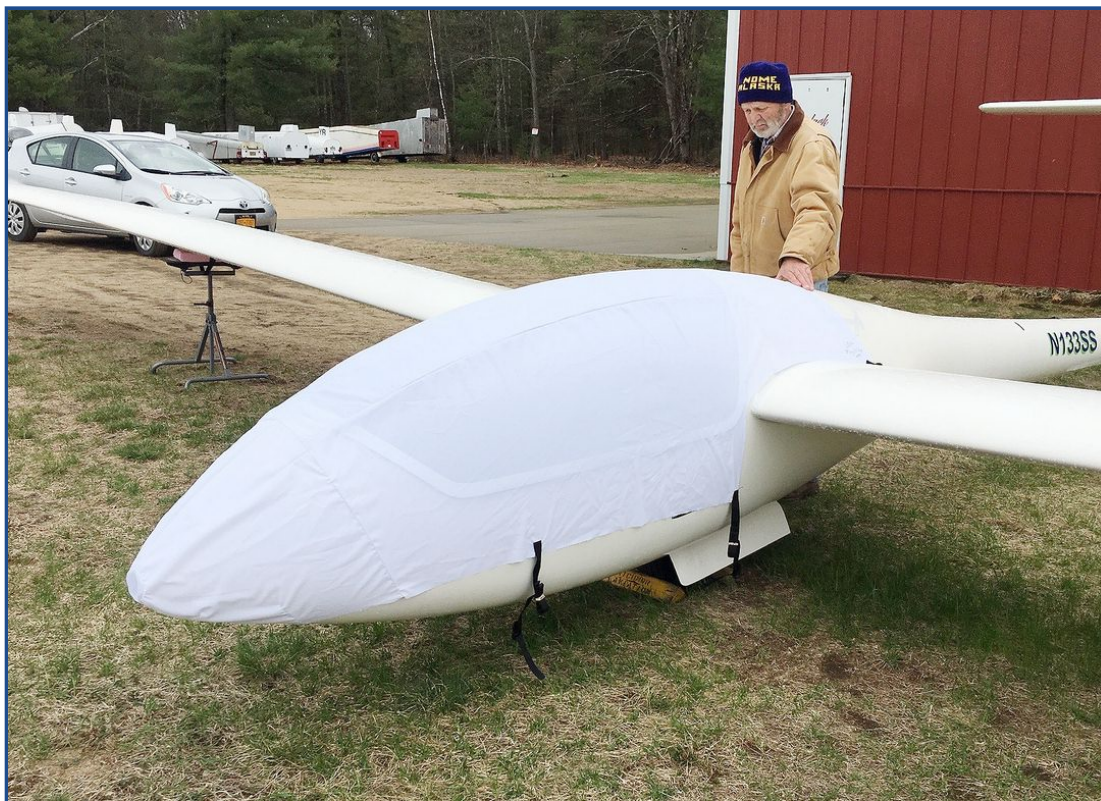
Grob 102 Astir CS Canopy/Nose Cover (test fit)