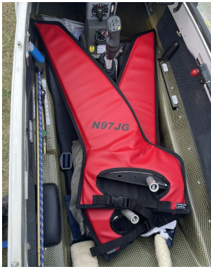
Schempp-Hirth Ventus-2B winglet/wingtip pads