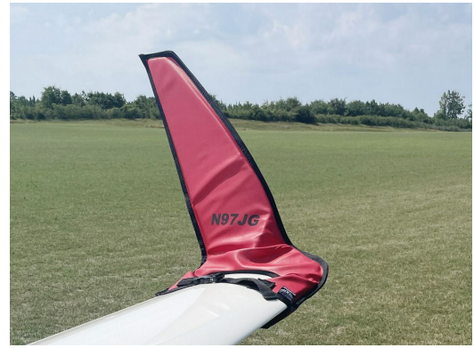
Schempp-Hirth Ventus-2B winglet/wingtip pads