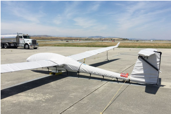
Schempp-Hirth Discus 2B Full Cover Set

WINTER USE MATERIAL - Made with Solution-Dyed Polyester fabric, this option is intended for seasonal use to aid in deicing, rain mitigation, or for occasional travel. The material is lighter and more compact, but more susceptible to UV damage and may have a shorter useful life if used continuously outside than the all-year use material.