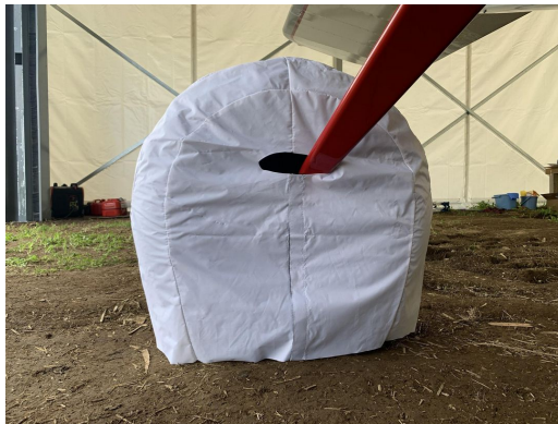
Cub Crafters CC19 Oversize Tire Covers, test fit cover

ALL-YEAR USE MATERIAL - Made with Silver Acrylic Sunbrella canvas, the all-year use material is the best option for sun protection and cover longevity. This heavier more durable material is intended for all weather conditions, such as rain and snow or lots of sun.