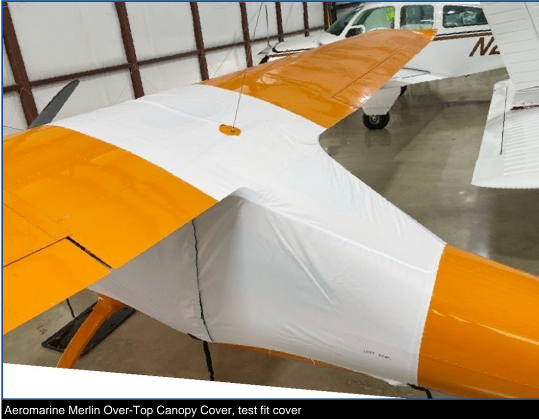
Aeromarine Merlin Over-Top Canopy Cover, test fit cover