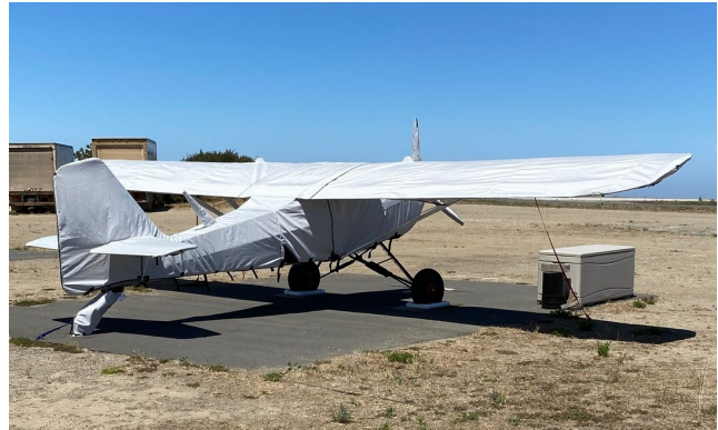
Kitfox Full Cover Set