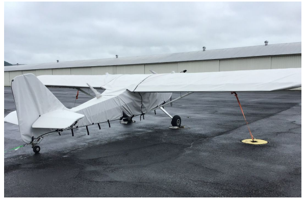
Kitfox 5 Complete Cover Set