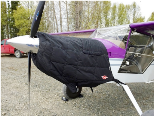
Kitfox Insulated Engine Cover

This cover type is made from Silver Acrylic Sunbrella canvas and is 100% lined with a soft and smooth microfiber. Bruce's Custom Covers developed this material combination especially for aircraft protection. The outer material is medium weight and treated for water resistance, UV resistance and anti-static buildup. The inner lining is a very soft and smooth microfiber to prevent scratching. The material is very reflective, and tests show that the cabin interior temperature can be reduced to near-ambient temperature on the hottest of days. It is water, ice and snow repellent, yet breathable to allow moisture to escape from between the cover and the aircraft surface.