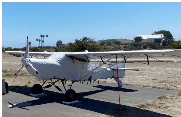
Kitfox Full Cover Set