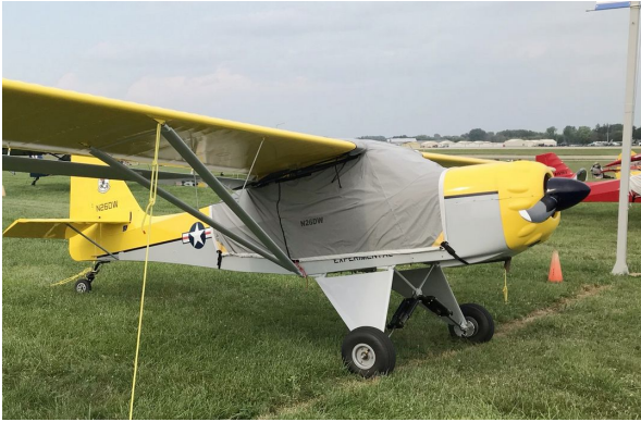
Kitfox Travel Canopy Cover

Travel Covers are made with Silver Solution-Dyed Polyester fabric and only lined over the windshield to save weight. The material is lightweight and more compact for easy stowage in the aircraft. The polyester material is water resistant, but only intended for occasional use outside. We also have an ultra lightweight material available for fitted hangar dust covers. For daily outdoor use, the non-travel Sunbrella Cover is the best choice.