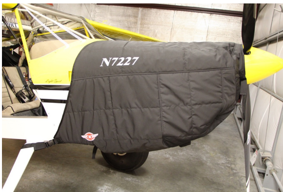
Kitfox Insulated Engine Cover

This cover type is made from Silver Acrylic Sunbrella canvas and is 100% lined with a soft and smooth microfiber. Bruce's Custom Covers developed this material combination especially for aircraft protection. The outer material is medium weight and treated for water resistance, UV resistance and anti-static buildup. The inner lining is a very soft and smooth microfiber to prevent scratching. The material is very reflective, and tests show that the cabin interior temperature can be reduced to near-ambient temperature on the hottest of days. It is water, ice and snow repellent, yet breathable to allow moisture to escape from between the cover and the aircraft surface.