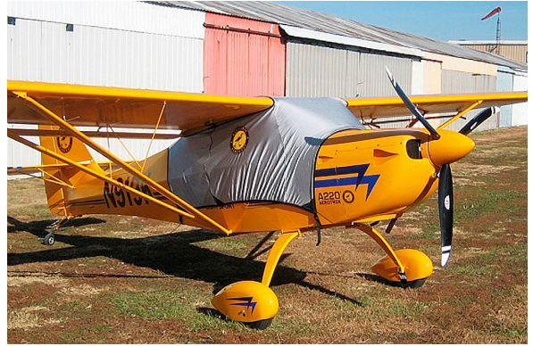
Aerotrek A220 Fitted Hangar Dust Cover