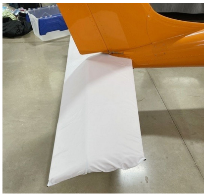
Aeromarine Merlin Horizontal Stabilizer Covers, test fit covers