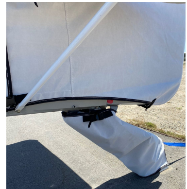
Kitfox Full Cover Set