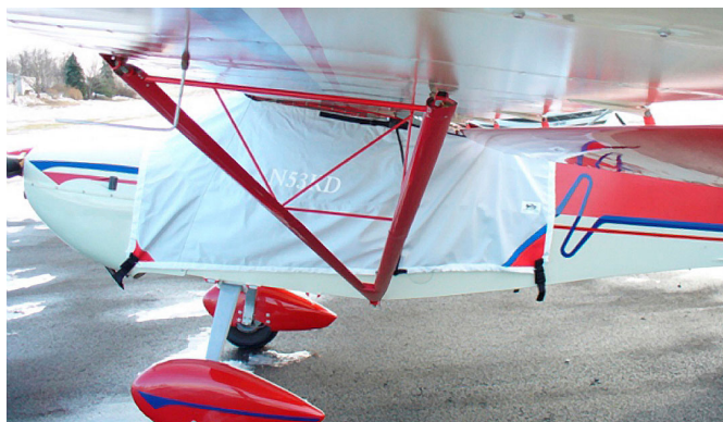
Kitfox IV Over-the-top Canopy Cover

This cover type is made from Silver Acrylic Sunbrella canvas and is 100% lined with a soft and smooth microfiber. Bruce's Custom Covers developed this material combination especially for aircraft protection. The outer material is medium weight and treated for water resistance, UV resistance and anti-static buildup. The inner lining is a very soft and smooth microfiber to prevent scratching. The material is very reflective, and tests show that the cabin interior temperature can be reduced to near-ambient temperature on the hottest of days. It is water, ice and snow repellent, yet breathable to allow moisture to escape from between the cover and the aircraft surface.