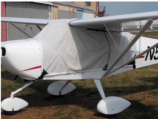
Aerotrek A240 Standard Canopy Cover

This cover type is made from Silver Acrylic Sunbrella canvas and is 100% lined with a soft and smooth microfiber. Bruce's Custom Covers developed this material combination especially for aircraft protection. The outer material is medium weight and treated for water resistance, UV resistance and anti-static buildup. The inner lining is a very soft and smooth microfiber to prevent scratching. The material is very reflective, and tests show that the cabin interior temperature can be reduced to near-ambient temperature on the hottest of days. It is water, ice and snow repellent, yet breathable to allow moisture to escape from between the cover and the aircraft surface.