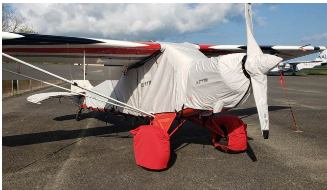
Aviat Husky Extended Canopy Cover, Engine, Prop, Empennage & Tire Covers

ALL-YEAR USE MATERIAL - Made with Silver Acrylic Sunbrella canvas, the all-year use material is the best option for sun protection and cover longevity. This heavier more durable material is intended for all weather conditions, such as rain and snow or lots of sun.