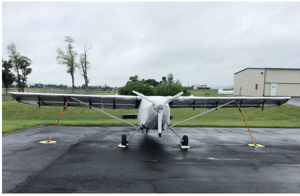
Kitfox 5 Complete Cover Set