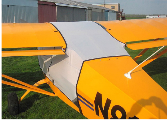
Aerotrek A240 Spandex FlyAway Travel Canopy Cover

Travel Covers are made with Silver Solution-Dyed Polyester fabric and only lined over the windshield to save weight. The material is lightweight and more compact for easy stowage in the aircraft. The polyester material is water resistant, but only intended for occasional use outside. We also have an ultra lightweight material available for fitted hangar dust covers. For daily outdoor use, the non-travel Sunbrella Cover is the best choice.