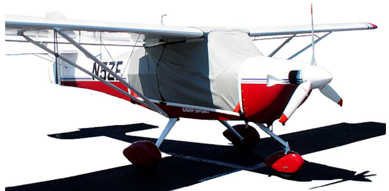
Aerotrek A240 Standard Canopy Cover