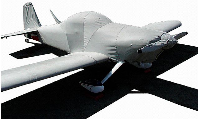
Van's RV-4 Complete Cover

This cover type is made from Silver Acrylic Sunbrella canvas and is 100% lined with a soft and smooth microfiber. Bruce's Custom Covers developed this material combination especially for aircraft protection. The outer material is medium weight and treated for water resistance, UV resistance and anti-static buildup. The inner lining is a very soft and smooth microfiber to prevent scratching. The material is very reflective, and tests show that the cabin interior temperature can be reduced to near-ambient temperature on the hottest of days. It is water, ice and snow repellent, yet breathable to allow moisture to escape from between the cover and the aircraft surface.