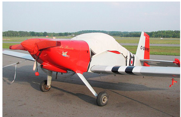
Van's RV-6 2-Blade Prop Cover