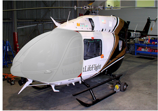
EC-145 Windshield/Nose Cover (illustration)