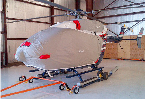
Bubble Cover w/ nose mounted radome & Upper Deck Plugs/Cover

This cover type is made from Silver Acrylic Sunbrella canvas and is 100% lined with a soft and smooth microfiber. Bruce's Custom Covers developed this material combination especially for aircraft protection. The outer material is medium weight and treated for water resistance, UV resistance and anti-static buildup. The inner lining is a very soft and smooth microfiber to prevent scratching. The material is very reflective, and tests show that the cabin interior temperature can be reduced to near-ambient temperature on the hottest of days. It is water, ice and snow repellent, yet breathable to allow moisture to escape from between the cover and the aircraft surface.