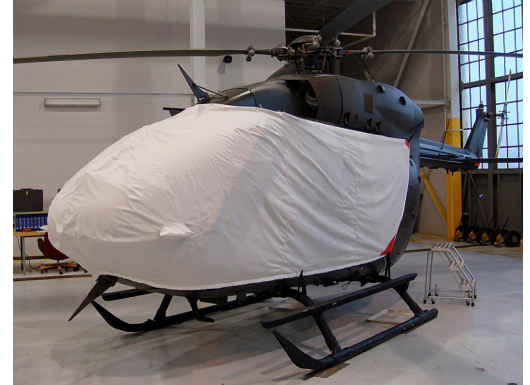
EC-145 Bubble Cover