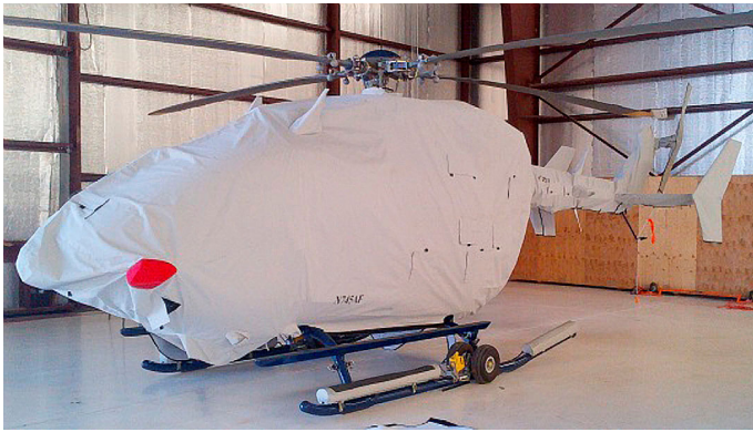
Main Body (also covers bottom), Tailboom, Vertical Pylon, Stabilizers and Tail Rotor Covers

Covers developed this material combination especially for aircraft protection. The outer material is medium weight and treated for water resistance, UV resistance and anti-static buildup. The inner lining is a very soft and smooth microfiber to prevent scratching. The material is very reflective, and tests show that the cabin interior temperature can be reduced to near-ambient temperature on the hottest of days. It is water, ice and snow repellent, yet breathable to allow moisture to escape from between the cover and the aircraft surface.