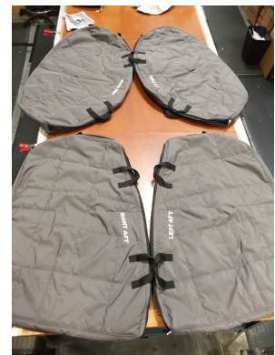
MD 500D Padded Door Bags