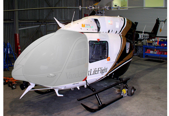
EC-145 Windshield/Nose Cover (illustration)