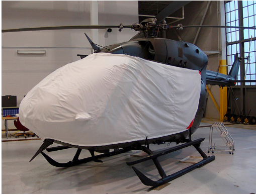
EC-145 Bubble Cover

Covers developed this material combination especially for aircraft protection. The outer material is medium weight and treated for water resistance, UV resistance and anti-static buildup. The inner lining is a very soft and smooth microfiber to prevent scratching. The material is very reflective, and tests show that the cabin interior temperature can be reduced to near-ambient temperature on the hottest of days. It is water, ice and snow repellent, yet breathable to allow moisture to escape from between the cover and the aircraft surface.