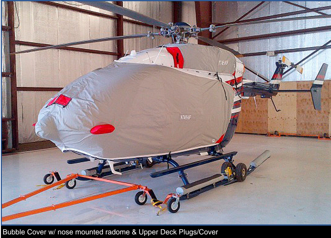
Bubble Cover w/ nose mounted radome &amp; Upper Deck Plugs/Cover