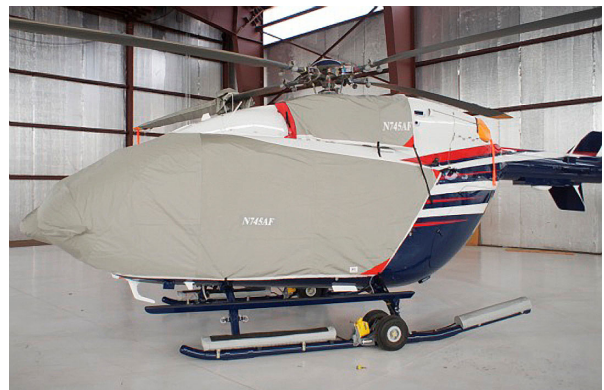
Bubble Cover w/ nose mounted radome, Upper Deck Plugs/Cover