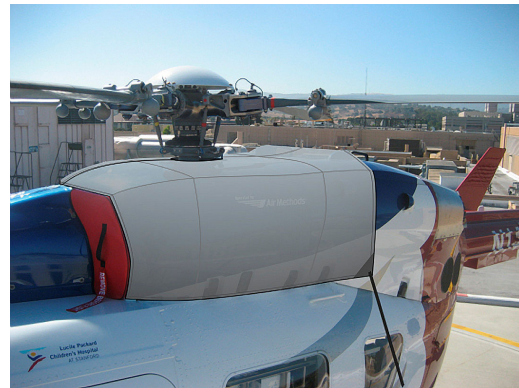
Upper Deck Plugs/Cover, extended to cover aft intake vents