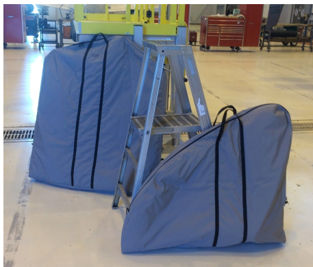
Eurocopter EC-145 Padded Bags for Removable Doors

**Padded Door Bags* are designed to provide portable protection of the doors when they are removed from the aircraft. They are padded to moderate thickness, zippered closed, and have sturdy carry handles for easy transport.