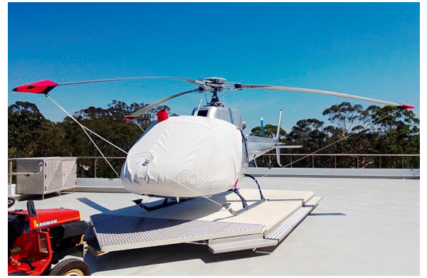
AS350 Bubble Cover, Blade Tie-downs