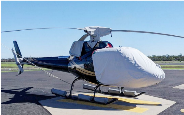
AS350 Bubble, Main Rotor, Intake & Tail Rotor Covers