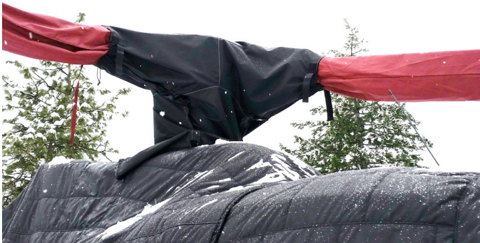
Main Rotor Hub Cover with swash plate extension.