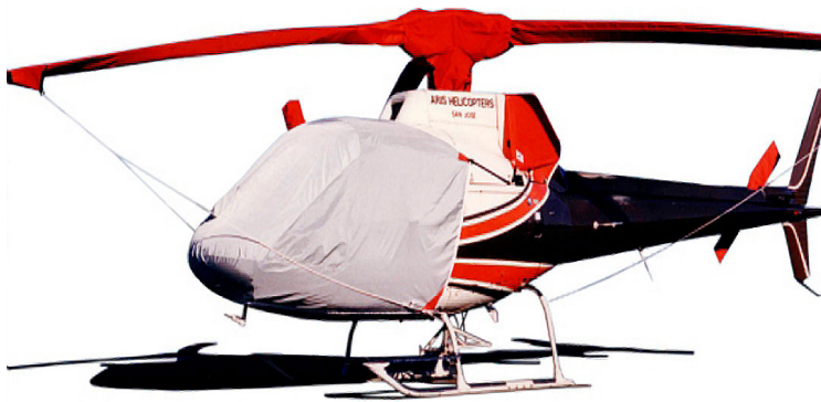
Bubble Cover, Intake/Exhaust, Rotor Mast, Tail Rotor & Main Body Covers