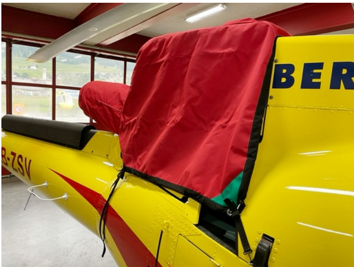
Airbus Helicopter H-125 & AS350 Intake/Exhaust Cover (newer design)

WINTER USE MATERIAL - Made with Solution-Dyed Polyester fabric, this option is intended for seasonal use to aid in deicing, rain mitigation, or for occasional travel. The material is lighter and more compact, but more susceptible to UV damage and may have a shorter useful life if used continuously outside than the all-year use material.