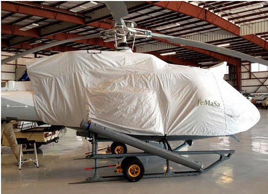
AS350 B3 Main Body Cover (Covers Bubble/Cabin, Engine Area and Exhaust)

water resistance, UV resistance and anti-static buildup. The inner lining is a very soft and smooth microfiber to prevent scratching. The material is very reflective, and tests show that the cabin interior temperature can be reduced to near-ambient temperature on the hottest of days. It is water, ice and snow repellent, yet breathable to allow moisture to escape from between the cover and the aircraft surface.