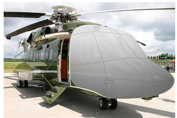
Sikorsky S-92 Windshield/Nose Cover (illustration)