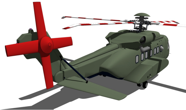
Sikorsky S-92 Tail Rotor Blade and Hub Covers

WINTER USE MATERIAL - Made with Solution-Dyed Polyester fabric, this option is intended for seasonal use to aid in deicing, rain mitigation, or for occasional travel. The material is lighter and more compact, but more susceptible to UV damage and may have a shorter useful life if used continuously outside than the all-year use material.