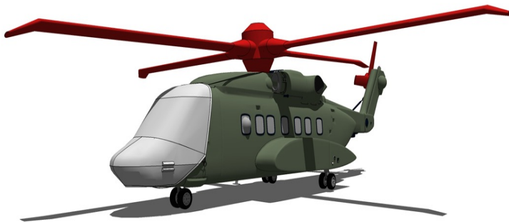
Sikorsky S-92 Windshield/Nose, Blade, Rotor Hub & Tail Rotor Covers

This cover type is made from Silver Acrylic Sunbrella canvas and is 100% lined with a soft and smooth microfiber. Bruce's Custom Covers developed this material combination especially for aircraft protection. The outer material is medium weight and treated for water resistance, UV resistance and anti-static buildup. The inner lining is a very soft and smooth microfiber to prevent scratching. The material is very reflective, and tests show that the cabin interior temperature can be reduced to near-ambient temperature on the hottest of days. It is water, ice and snow repellent, yet breathable to allow moisture to escape from between the cover and the aircraft surface.