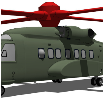
Sikorsky S-92 Main Rotor Hub Cover

WINTER USE MATERIAL - Made with Solution-Dyed Polyester fabric, this option is intended for seasonal use to aid in deicing, rain mitigation, or for occasional travel. The material is lighter and more compact, but more susceptible to UV damage and may have a shorter useful life if used continuously outside than the all-year use material.