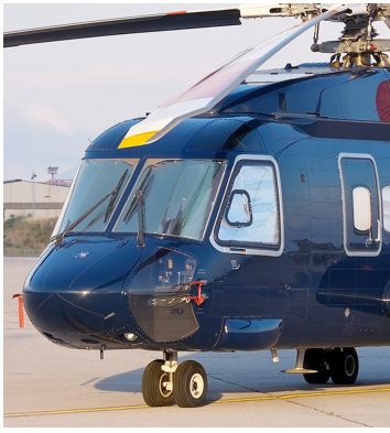
Sikorsky S-92 Cockpit HeatShields