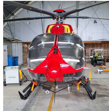
Airbus Helicopter H145D3 Windshield Heatshields, Engine Plugs