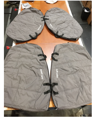
MD 500D Padded Door Bags