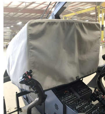
Eurocopter EC-135 Instrument Panel Heatshield Cover