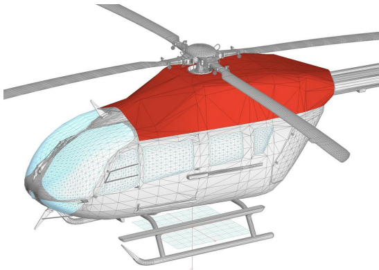
Intake/Exhaust Engine Area Cover, 3D Rendering

The Engine Inlet Plugs are custom fit for your Airbus Helicopter H145, UH-145, BK-117 D-2, D-3 intakes, made with heavy-duty vinyl material, and stuffed with a single block of sculpted urethane foam. Each plug has a zipper that allows the foam to be removed and dried if necessary. Engine plugs have 'Remove Before Flight' streamers sewn onto the face of the plugs. Most plugs are imprinted with the aircraft registration number in black for an extra charge. Storage bag NOT included. Engine plugs may be inserted after flight when the engine is still warm. Engine Inlet Plugs are commonly referred to as Cowl Plugs, Intake Plugs, Cowl Blocks, Engine Blocks, and Engine Bunges.