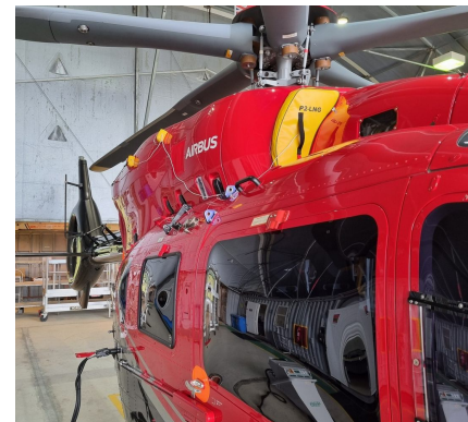
Airbus Helicopter H145D3 Intake Plugs