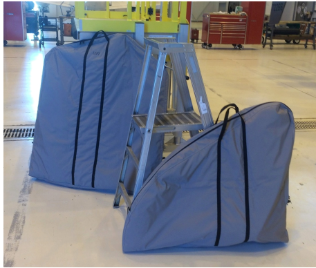
Eurocopter EC-145 Padded Bags for Removable Doors

**Padded Door Bags* are designed to provide portable protection of the doors when they are removed from the aircraft. They are padded to moderate thickness, zippered closed, and have sturdy carry handles for easy transport.