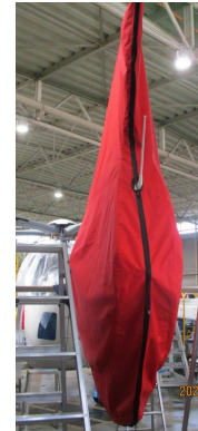
Airbus EC145 Tailfan Housing Fenestron Cover