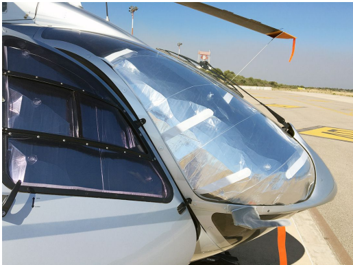
Eurocopter EC-145 Cockpit Heatshields