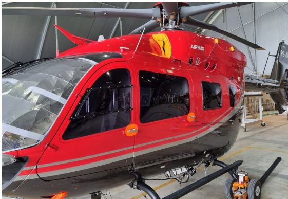
Airbus Helicopter H145D3 Intake Plugs

The Engine Inlet Plugs are custom fit for your Airbus Helicopter H145, UH-145, BK-117 D-2, D-3 intakes, made with heavy-duty vinyl material, and stuffed with a single block of sculpted urethane foam. Each plug has a zipper that allows the foam to be removed and dried if necessary. Engine plugs have 'Remove Before Flight' streamers sewn onto the face of the plugs. Most plugs are imprinted with the aircraft registration number in black for an extra charge. Storage bag NOT included. Engine plugs may be inserted after flight when the engine is still warm. Engine Inlet Plugs are commonly referred to as Cowl Plugs, Intake Plugs, Cowl Blocks, Engine Blocks, and Engine Bungs.