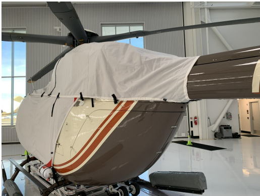
Eurocopter 145 Engine Area Cover, Bubble Cover

This cover type is made from Silver Acrylic Sunbrella canvas and is 100% lined with a soft and smooth microfiber. Bruce's Custom Covers developed this material combination especially for aircraft protection. The outer material is medium weight and treated for water resistance, UV resistance and anti-static buildup. The inner lining is a very soft and smooth microfiber to prevent scratching. The material is very reflective, and tests show that the cabin interior temperature can be reduced to near-ambient temperature on the hottest of days. It is water, ice and snow repellent, yet breathable to allow moisture to escape from between the cover and the aircraft surface.