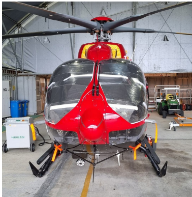
Airbus Helicopter H145D3 Windshield Heatshields, Engine Plugs

The Engine Inlet Plugs are custom fit for your Airbus Helicopter EC-145, UH-145, BK-117 D-2 intakes, made with heavy-duty vinyl material, and stuffed with a single block of sculpted urethane foam. Each plug has a zipper that allows the foam to be removed and dried if necessary. Engine plugs have 'Remove Before Flight' streamers sewn onto the face of the plugs. Most plugs are imprinted with the aircraft registration number in black for an extra charge. Storage bag NOT included. Engine plugs may be inserted after flight when the engine is still warm. Engine Inlet Plugs are commonly referred to as Cowl Plugs, Intake Plugs, Cowl Blocks, Engine Blocks, and Engine Bungs.