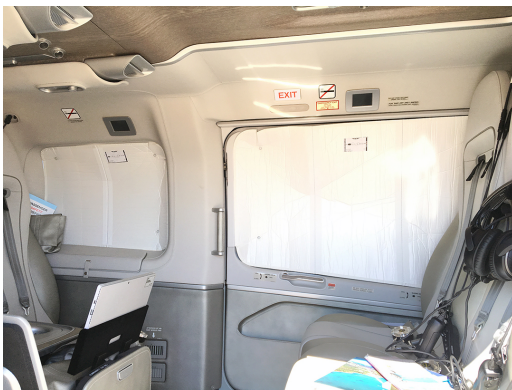
Eurocopter EC-145 Cabin Heatshields

Heatshields are interior sunshades for an aircraft's windows or canopy glass. The product is a unique composite of closed-cell foam with a silver mylar finish. The semi-rigid design is stiff enough to stand along the inside of the windshield using sun visors or window framing. It folds up flat and easily stores in the included storage sleeve. Some designs may require velcro and suction cups. A Heatshield is an excellent short-term remedy for cockpit overheating.