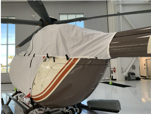
Eurocopter 145 Engine Area Cover, Bubble Cover

This cover type is made from Silver Acrylic Sunbrella canvas and is 100% lined with a soft and smooth microfiber. Bruce's Custom Covers developed this material combination especially for aircraft protection. The outer material is medium weight and treated for water resistance, UV resistance and anti-static buildup. The inner lining is a very soft and smooth microfiber to prevent scratching. The material is very reflective, and tests show that the cabin interior temperature can be reduced to near-ambient temperature on the hottest of days. It is water, ice and snow repellent, yet breathable to allow moisture to escape from between the cover and the aircraft surface.