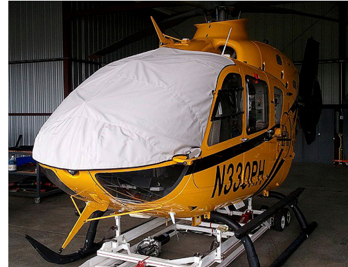
Eurocopter EC-145 Main Body Cover, also covers the bottom belly EC-135 Windshield/Skylights Cover, pinches in door jambs