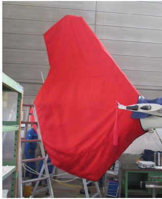
Airbus EC145 Tailfan Housing Fenestron Cover

The Tailboom Cover details vary by model, but generally the helicopter tail boom cover encloses the tail boom from the "bottleneck" to the aft end. They usually also cover the horizontal stabilizers, and are custom made to allow for antennae, lights, and other protrusions. They attach with straps underneath the tail boom. Covers for the vertical and horizontal stabilizers are also available separately. Specific information for each model is available on request.