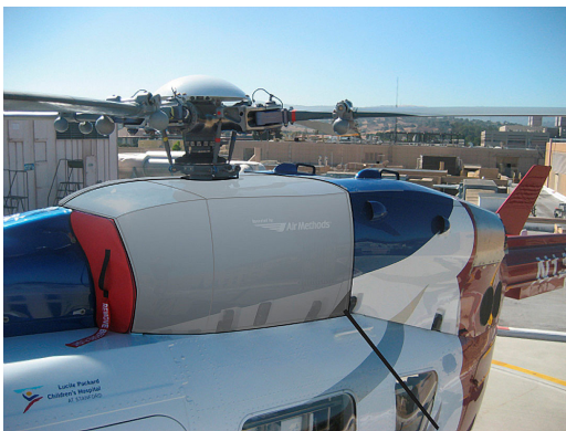
Upper Deck Plugs/Cover

The Engine Inlet Plugs are custom fit for your Airbus Helicopter H145, UH-145, BK-117 D-2, D-3 intakes, made with heavy-duty vinyl material, and stuffed with a single block of sculpted urethane foam. Each plug has a zipper that allows the foam to be removed and dried if necessary. Engine plugs have 'Remove Before Flight' streamers sewn onto the face of the plugs. Most plugs are imprinted with the aircraft registration number in black for an extra charge. Storage bag NOT included. Engine plugs may be inserted after flight when the engine is still warm. Engine Inlet Plugs are commonly referred to as Cowl Plugs, Intake Plugs, Cowl Blocks, Engine Blocks, and Engine Bunges.