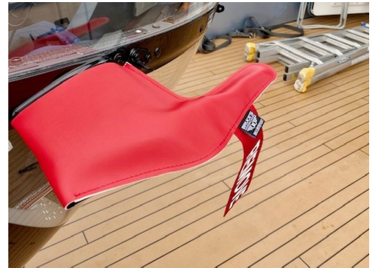
Airbus Helicopter H145 Pitot Tube Cover