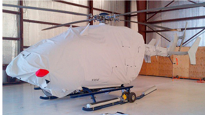
Main Body (also covers bottom), Tailboom, Vertical Pylon, Stabilizers and Tail Rotor Covers