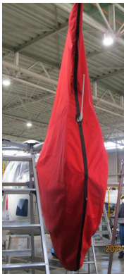
Airbus EC145 Tailfan Housing Fenestron Cover

The Tailboom Cover details vary by model, but generally the helicopter tail boom cover encloses the tail boom from the "bottleneck" to the aft end. They usually also cover the horizontal stabilizers, and are custom made to allow for antennae, lights, and other protrusions. They attach with straps underneath the tail boom. Covers for the vertical and horizontal stabilizers are also available separately. Specific information for each model is available on request.