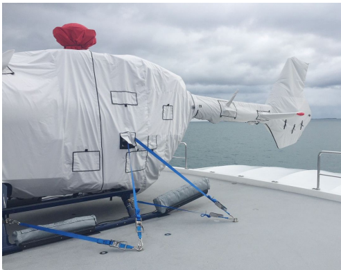
Eurocopter EC-145 D2 Main Body Cover, Tailboom/Fenestron Cover