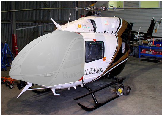
EC-145 Windshield/Nose Cover (illustration)