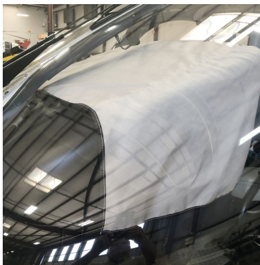
Eurocopter EC-135 Instrument Panel Heatshield Cover

Heatshields are interior sunshades for an aircraft's windows or canopy glass. The product is a unique composite of closed-cell foam with a silver mylar finish. The semi-rigid design is stiff enough to stand along the inside of the windshield using sun visors or window framing. It folds up flat and easily stores in the included storage sleeve. Some designs may require velcro and suction cups. A Heatshield is an excellent short-term remedy for cockpit overheating.