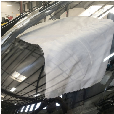
Eurocopter EC-135 Instrument Panel Heatshield Cover

Heatshields are interior sunshades for an aircraft's windows or canopy glass. The product is a unique composite of closed-cell foam with a silver mylar finish. The semi-rigid design is stiff enough to stand along the inside of the windshield using sun visors or window framing. It folds up flat and easily stores in the included storage sleeve. Some designs may require velcro and suction cups. A Heatshield is an excellent short-term remedy for cockpit overheating.