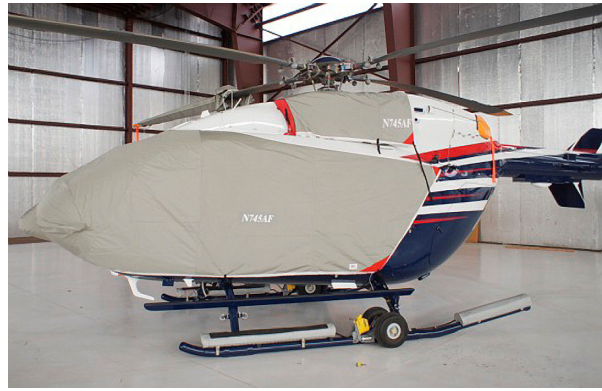
Bubble Cover w/ nose mounted radome, Upper Deck Plugs/Cover