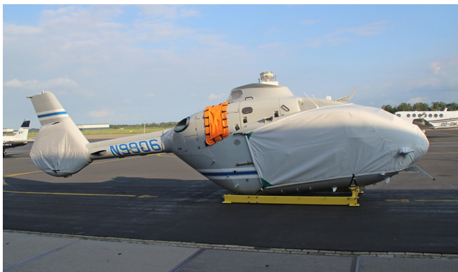
Eurocopter EC-135 Bubble & Tailfan Covers

The Tailboom Cover details vary by model, but generally the helicopter tail boom cover encloses the tail boom from the "bottleneck" to the aft end. They usually also cover the horizontal stabilizers, and are custom made to allow for antennae, lights, and other protrusions. They attach with straps underneath the tail boom. Covers for the vertical and horizontal stabilizers are also available separately. Specific information for each model is available on request.