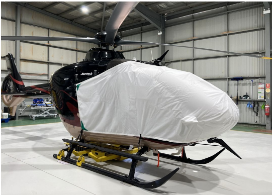
Airbus EC-135 Bubble Cover (with Wire Strike)