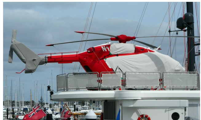
Eurocopter EC-135 Bubble, Engine, Rotor Hub, Tail Surfaces Covers