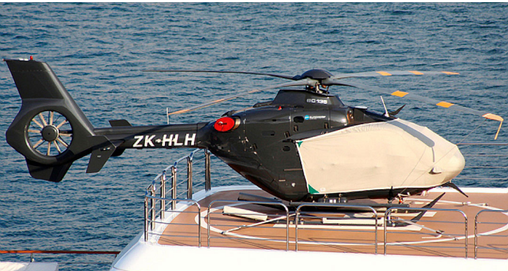
EC-135 Windshield/Skylights Cover, pinches in door jambs