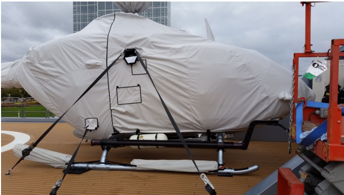
EC-135 Full Cover Set