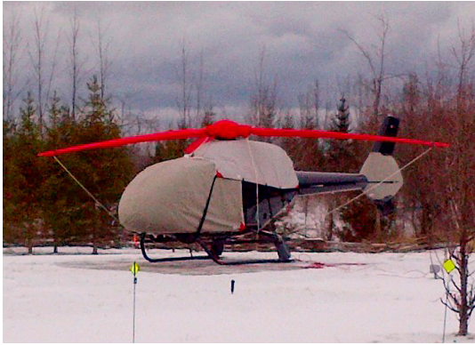
EC-130 Bubble, Engine, Rotor Hub, Blade & Tailfan Covers

some air circulation and drainage in freezing weather. Some part numbers have features for an extra charge.