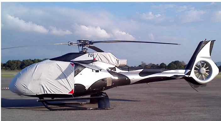
Bubble Cover and Intake/Exhaust Cover

The Engine Exhaust Plugs are custom fit for your Airbus Helicopter H-130 exhaust openings, made with heavy-duty vinyl material, and stuffed with a single block of sculpted urethane foam. Exhaust plugs have 'Remove Before Flight' streamers sewn onto the face of the plugs. Exhaust plugs may be inserted soon after flight when the engine is still warm. Engine Inlet Plugs are commonly referred to as Cowl Plugs, Intake Plugs, Cowl Blocks, Engine Blocks, and Engine Bungs.