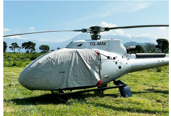
Airbus H-130 Insulated Bubble Cover