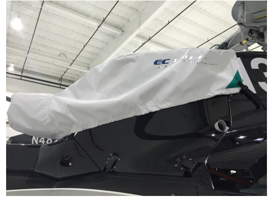
EC-130 Engine Area/Exhaust Cover