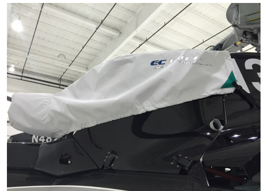
EC-130 Engine Area/Exhaust Cover