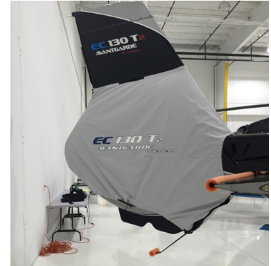
EC-130 Tailfan Cover