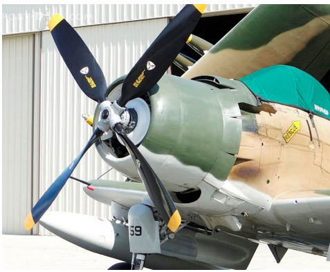
Douglas Skyraider Canopy Cover