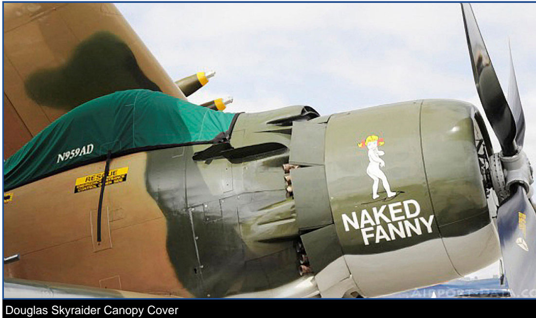
Douglas Skyraider Canopy Cover