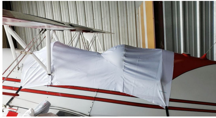
Acro Sport 2 Canopy Cover, test fit cover