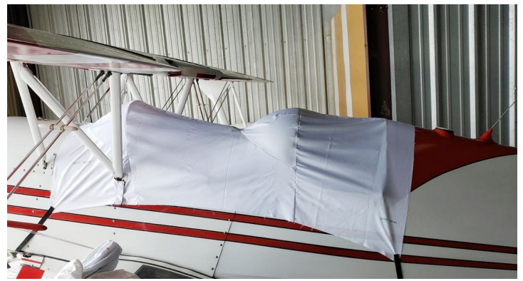
Acro Sport 2 Canopy Cover, test fit cover