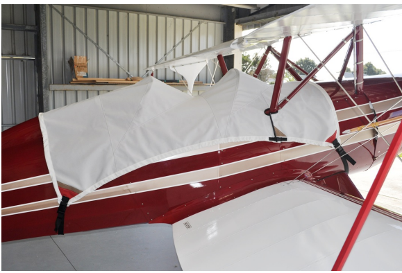
Starduster Too Canopy Cover