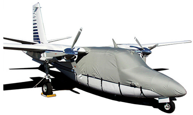
Aero Commander 500S Canopy/Nose Cover