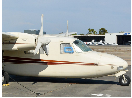
Aero Commander AC500 Ptopellor/Spinner Covers