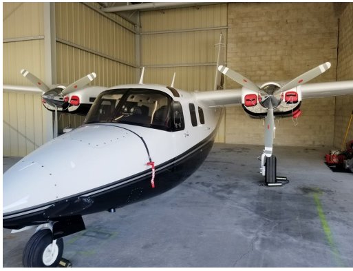
Aero Commander 500-A Pitot Covers