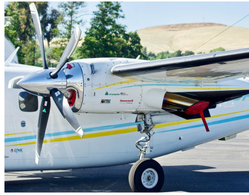
Aero Commander 690B Engine Inlet & Exhaust Plugs