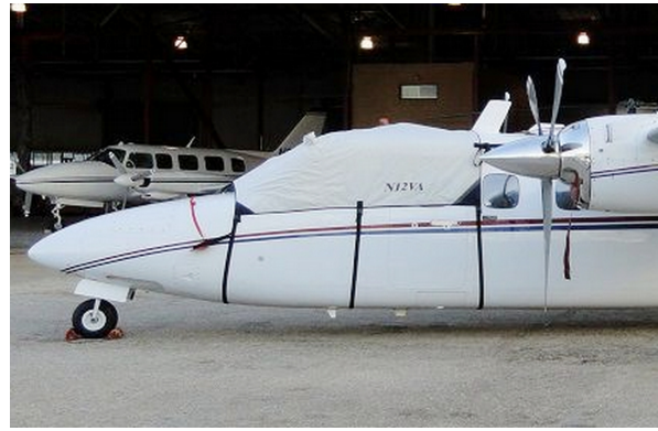
Rockwell Aero Commander 685, 690 & 840 Cockpit Cover