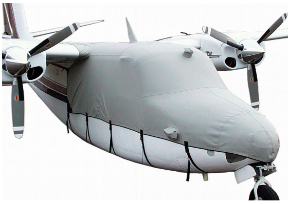
Canopy/Nose Cover (extends over top past leading edge)