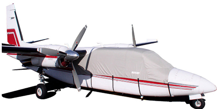
Aero Commander 690b Canopy Cover