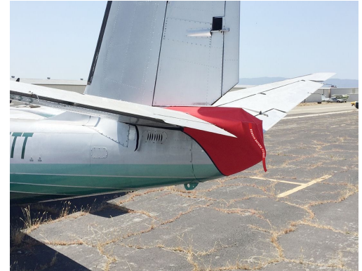
Rockwell Aero Commander Tailcone Cover