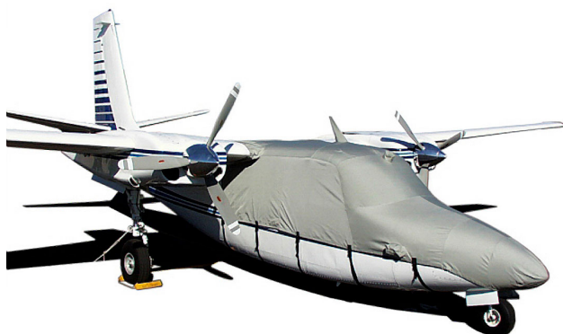
Aero Commander 500S Canopy/Nose Cover