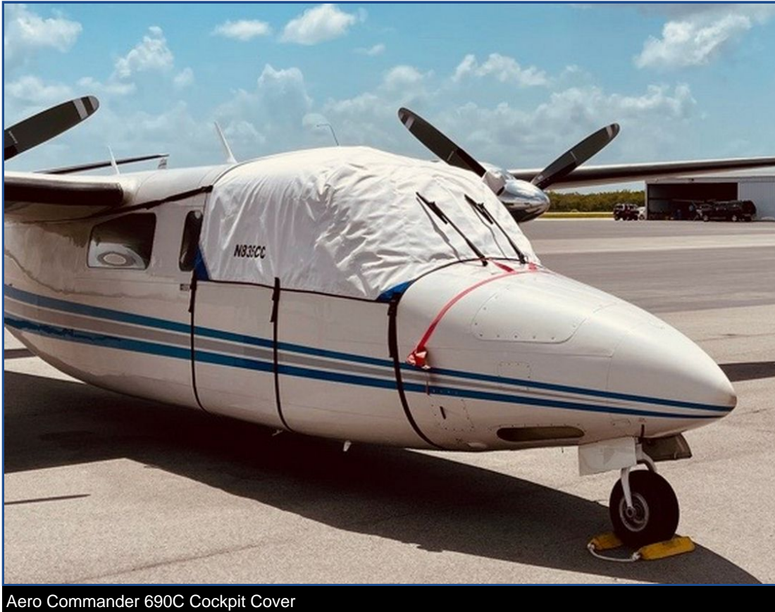
Aero Commander 690C Cockpit Cover