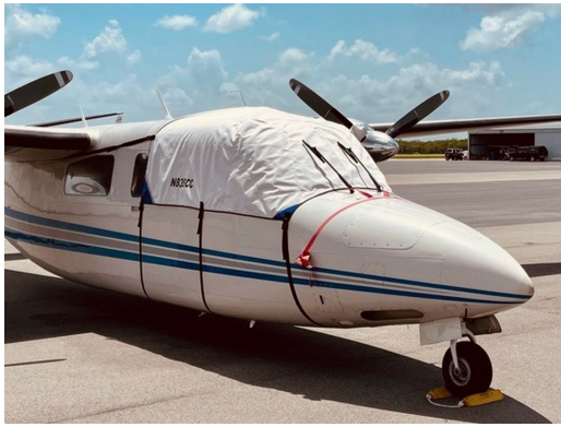
Aero Commander 690C Cockpit Cover