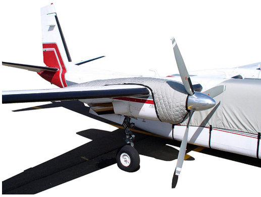
Aero Commander Insulated Engine Cover