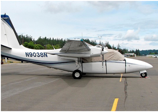
Aero Commander 500 Canopy Cover