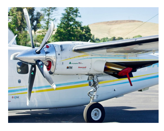
Aero Commander 690B Engine Inlet & Exhaust Plugs