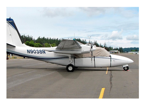
Aero Commander 500 Canopy Cover