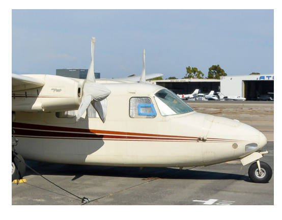
Aero Commander AC500 Ptopellor/Spinner Covers