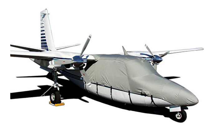
Aero Commander 690b Canopy Cover