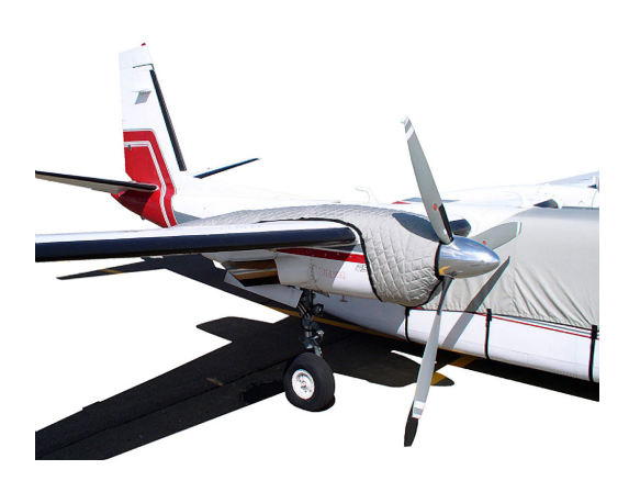
Aero Commander Insulated Engine Cover