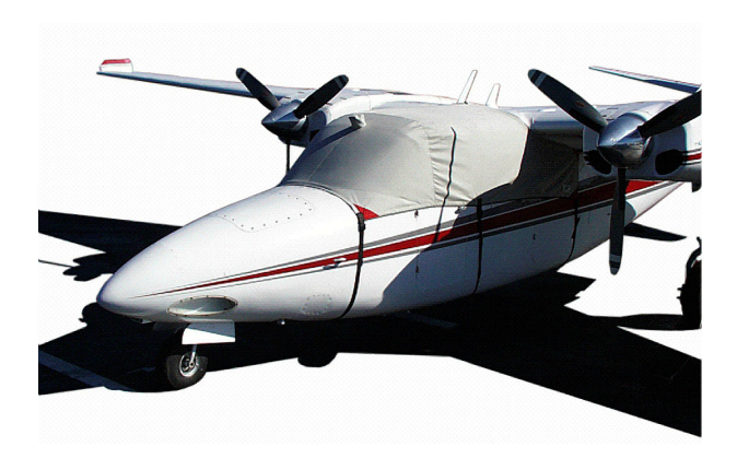
Aero Commander 680 Canopy Cover