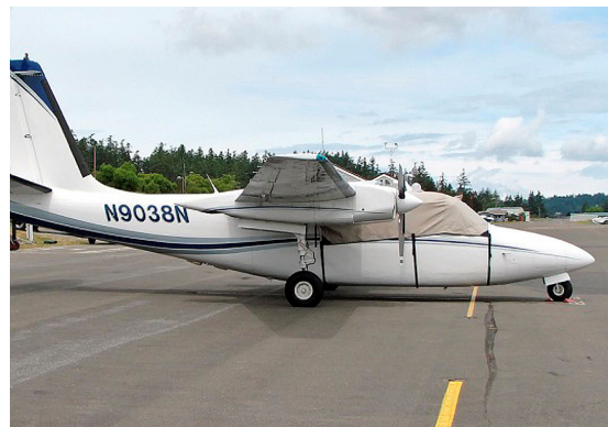
Aero Commander 500 Canopy Cover