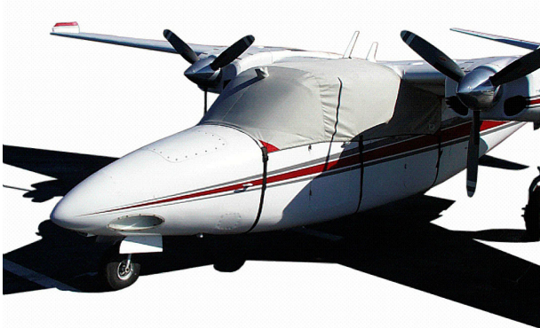
Aero Commander 680 Canopy Cover

Travel Covers are made with Silver Solution-Dyed Polyester fabric and only lined over the windshield to save weight. The material is lightweight and more compact for easy stowage in the aircraft. The polyester material is water resistant, but only intended for occasional use outside. We also have an ultra lightweight material available for fitted hangar dust covers. For daily outdoor use, the non-travel Sunbrella Cover is the best choice.