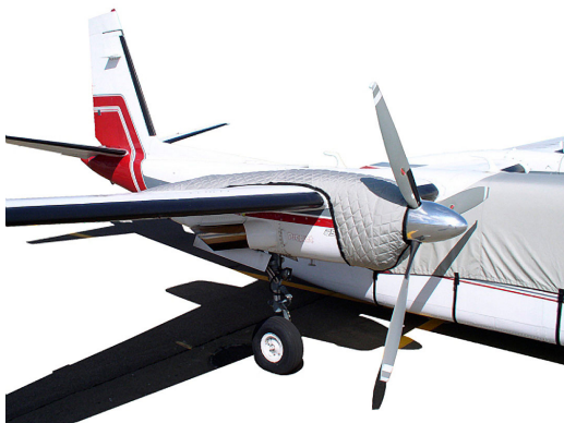
Aero Commander Insulated Engine Cover

This cover type is made from Silver Acrylic Sunbrella canvas and is 100% lined with a soft and smooth microfiber. Bruce's Custom Covers developed this material combination especially for aircraft protection. The outer material is medium weight and treated for water resistance, UV resistance and anti-static buildup. The inner lining is a very soft and smooth microfiber to prevent scratching. The material is very reflective, and tests show that the cabin interior temperature can be reduced to near-ambient temperature on the hottest of days. It is water, ice and snow repellent, yet breathable to allow moisture to escape from between the cover and the aircraft surface.