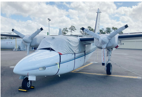
Aero Commander 500S Shrike Canopy, Engine & Prop Covers

This cover type is made from Silver Acrylic Sunbrella canvas and is 100% lined with a soft and smooth microfiber. Bruce's Custom Covers developed this material combination especially for aircraft protection. The outer material is medium weight and treated for water resistance, UV resistance and anti-static buildup. The inner lining is a very soft and smooth microfiber to prevent scratching. The material is very reflective, and tests show that the cabin interior temperature can be reduced to near-ambient temperature on the hottest of days. It is water, ice and snow repellent, yet breathable to allow moisture to escape from between the cover and the aircraft surface.