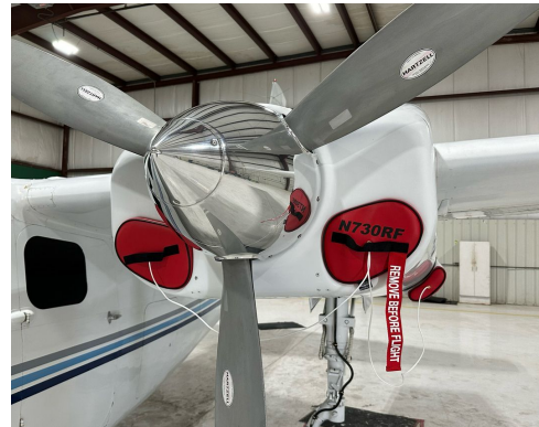
Aero Commander 500B Engine Intake Plugs