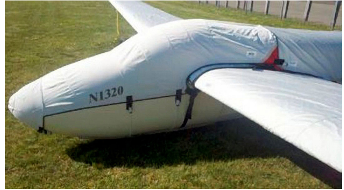
Schweizer SGS 1-26B Canopy/Nose, Wings & Empennage Covers