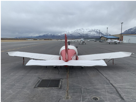
Grumman AA-1 Wing & Horizontal Stabilizer Covers