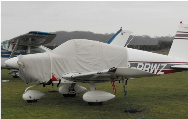
Grumman AA1 Extended Canopy Cover, Engine Cover