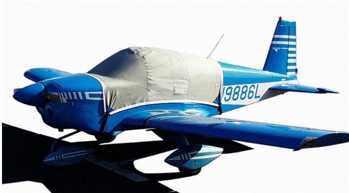
AA1 Standard Canopy Cover

This cover type is made from Silver Acrylic Sunbrella canvas and is 100% lined with a soft and smooth microfiber. Bruce's Custom Covers developed this material combination especially for aircraft protection. The outer material is medium weight and treated for water resistance, UV resistance and anti-static buildup. The inner lining is a very soft and smooth microfiber to prevent scratching. The material is very reflective, and tests show that the cabin interior temperature can be reduced to near-ambient temperature on the hottest of days. It is water, ice and snow repellent, yet breathable to allow moisture to escape from between the cover and the aircraft surface.