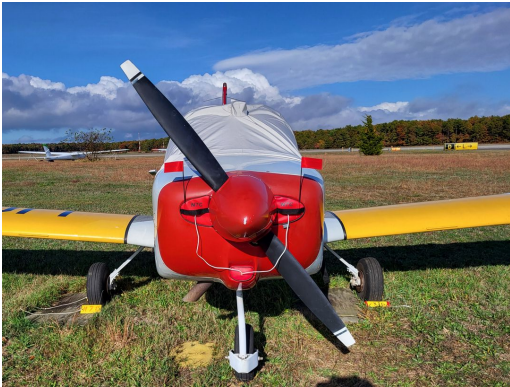
Grumman AA-1A Lynx Engine Inlet Plugs