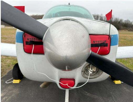
Grumman AA-1B Engine Inlet Plugs

and dried if necessary. Engine plugs have warning flags that are visible from the cockpit or 'remove before flight' streamers sewn onto the face of the plugs. Most plugs are imprinted with the aircraft registration number in black for an extra charge. Storage bag NOT included. Engine plugs may be inserted after flight when the engine is still warm. Engine Inlet Plugs are commonly referred to as Cowl Plugs, Intake Plugs, Cowl Blocks, Engine Blocks, and Engine Bungs.