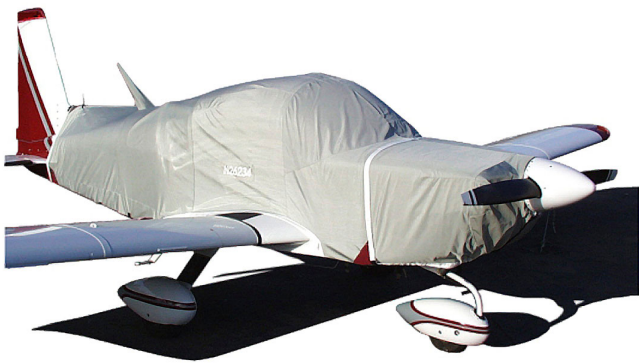
Grumman AA-5 Extended Canopy Cover & Engine Cover

This cover type is made from Silver Acrylic Sunbrella canvas and is 100% lined with a soft and smooth microfiber. Bruce's Custom Covers developed this material combination especially for aircraft protection. The outer material is medium weight and treated for water resistance, UV resistance and anti-static buildup. The inner lining is a very soft and smooth microfiber to prevent scratching. The material is very reflective, and tests show that the cabin interior temperature can be reduced to near-ambient temperature on the hottest of days. It is water, ice and snow repellent, yet breathable to allow moisture to escape from between the cover and the aircraft surface.