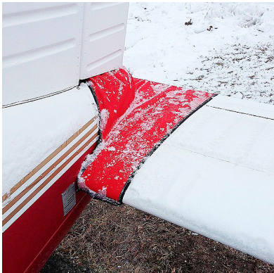
Piper PA-28 Tailcone Cover

WINTER USE MATERIAL - Made with Solution-Dyed Polyester fabric, this option is intended for seasonal use to aid in deicing, rain mitigation, or for occasional travel. The material is lighter and more compact, but more susceptible to UV damage and may have a shorter useful life if used continuously outside than the all-year use material.