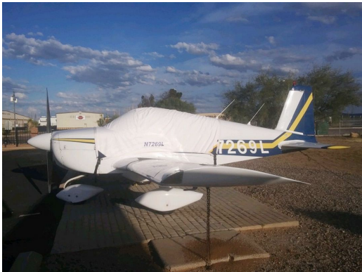
Grumman AA-1A Canopy Cover