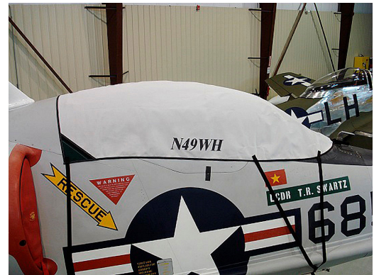
A-4 Skyhawk Canopy Cover