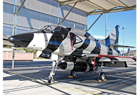
A4 Skyhawk Engine Inlet Plugs