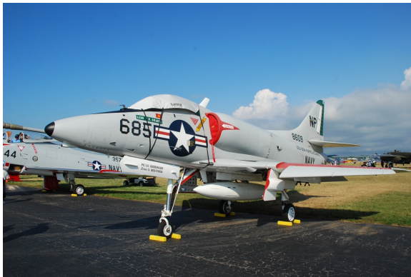
A-4 Skyhawk Canopy Cover

This cover type is made from Silver Acrylic Sunbrella canvas and is 100% lined with a soft and smooth microfiber. Bruce's Custom Covers developed this material combination especially for aircraft protection. The outer material is medium weight and treated for water resistance, UV resistance and anti-static buildup. The inner lining is a very soft and smooth microfiber to prevent scratching. The material is very reflective, and tests show that the cabin interior temperature can be reduced to near-ambient temperature on the hottest of days. It is water, ice and snow repellent, yet breathable to allow moisture to escape from between the cover and the aircraft surface.