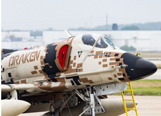
McDonnell Douglas A4 Skyhawk Engine Intake Plugs

The Engine Inlet Plugs are custom fit for your McDonnell Douglas A-4 Skyhawk, single & tandem intakes, made with heavy-duty vinyl material, and stuffed with a single block of sculpted urethane foam. Each plug has a zipper that allows the foam to be removed and dried if necessary. Engine plugs have 'remove before flight' streamers sewn onto the face of the plugs. Most plugs are imprinted with the aircraft registration number in black for an extra charge. Storage bag NOT included. Engine plugs may be inserted after flight when the engine is still warm. Engine Inlet Plugs are commonly referred to as Cowl Plugs, Intake Plugs, Cowl Blocks, Engine Blocks, and Engine Bunges.