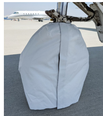
CJ1 Nose Gear Tire Cover, test fit