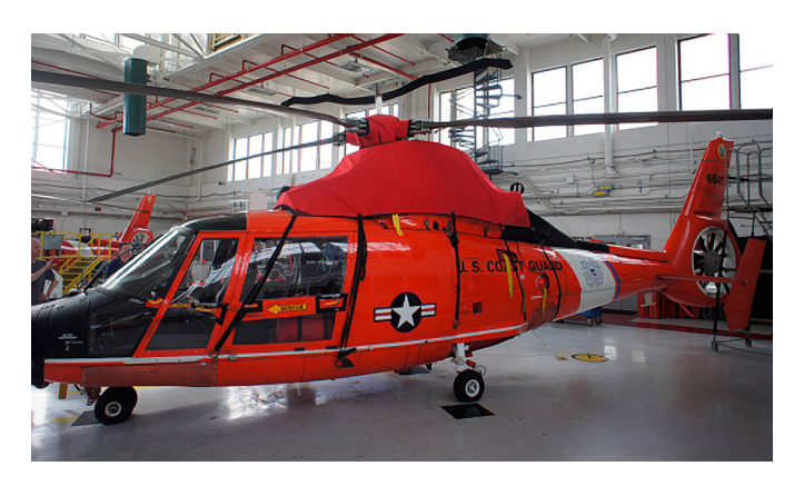
MH-65C Rotor Hub, Swash Plate Aperture, Engine Area Cover set, P/N: A365-210