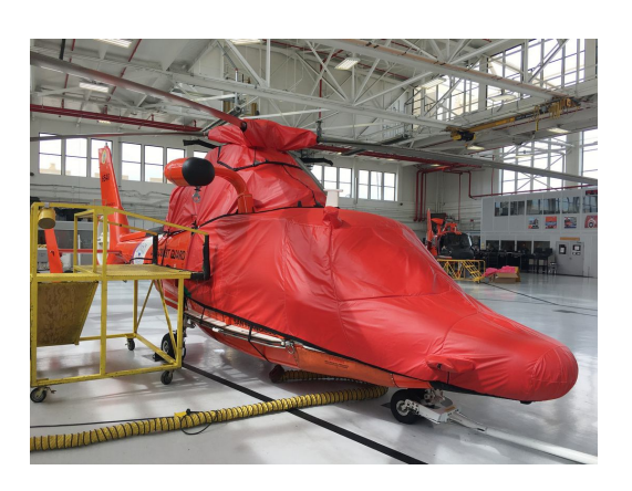
U.S. Coast Guard HH-65 Dolphin Bubble, Engine & Rotor Mast Covers