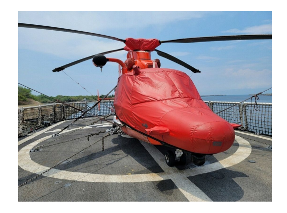
Aerospatiale AS365N2 Bubble, w/Extended Nose/Radome

Insulated Covers Material - A special composite material of solution-dyed polyester, 3M Thinsulate insulation, and soft nylon interior fabric. Our insulated covers are designed to complement an engine preheater and help retain heat in the engine compartment after shutdown. If you operate your aircraft in cold-weather, these covers will help prevent engine wear and tear.