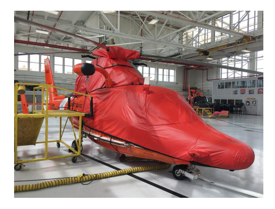
U.S. Coast Guard HH-65 Dolphin Bubble, Engine & Rotor Mast Covers U.S. Coast Guard HH-65 Dolphin Bubble, Engine & Rotor Mast Covers