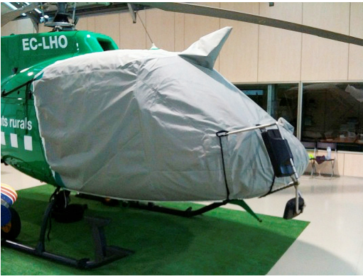
AS350 Bubble Cover with Wire Strike and Cargo Mirror