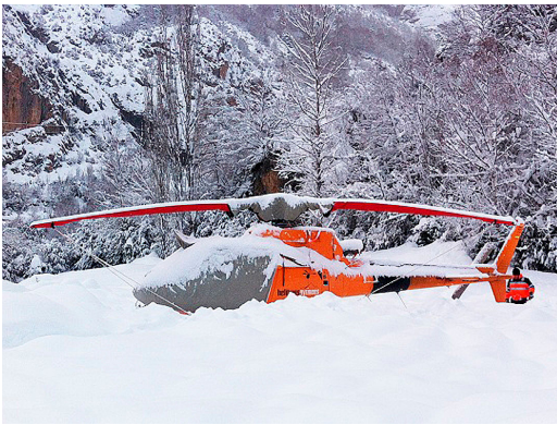
AS350 Bubble Cover, Insulated Main & Tail Rotor Covers, Blade Covers with tie-down detail

WINTER USE MATERIAL - Made with Solution-Dyed Polyester fabric, this option is intended for seasonal use to aid in deicing, rain mitigation, or for occasional travel. The material is lighter and more compact, but more susceptible to UV damage and may have a shorter useful life if used continuously outside than the all-year use material.