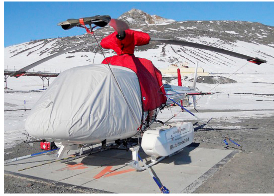
AS350 Bubble Cover w/ Cargo Mirror, Blade Tie-downs, Insulated Engine, Insulated Main Rotor Hub and Insulated Tail Rotor Covers