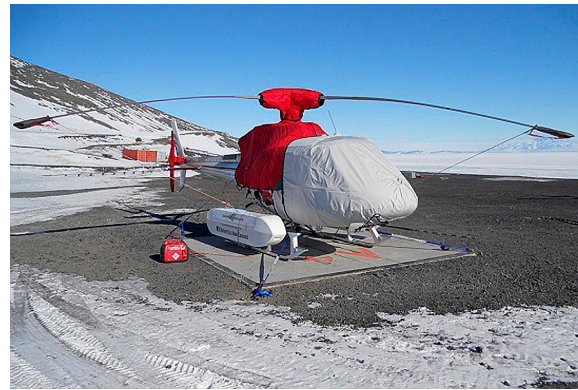
AS350 Bubble Cover w/ Cargo Mirror, Blade Tie-downs, Insulated Engine, Insulated Main Rotor Hub & Insulated Tail Rotor Covers