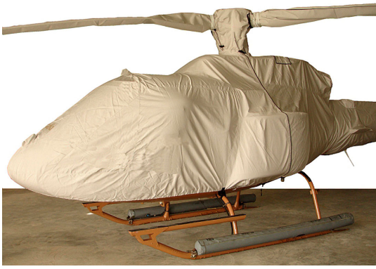
AS350 Main Body, Rotor Head, Blades and Tailboom Covers