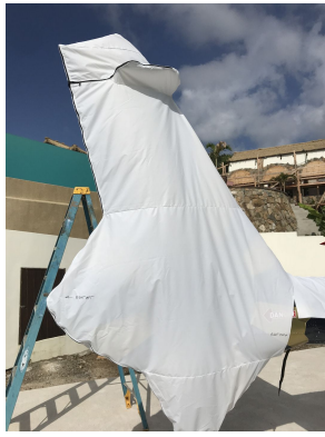
Aerospatiale Gazelle AS341 Tailfan Housing Extended Cover (test fit cover)