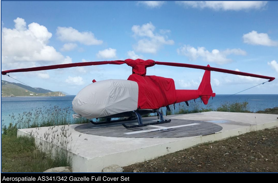
Aerospatiale AS341/342 Gazelle Full Cover Set