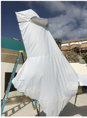
Aerospatiale Gazelle AS341 Tailfan Housing Extended Cover (test fit cover)