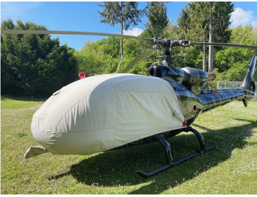
Aerospatiale Gazelle Bubble Cover