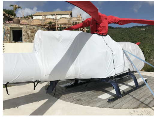
Aerospatiale Gazelle AS341 Bubble, Rotor Mast, Blade, Engine & Tailboom Covers (some are test fit covers)