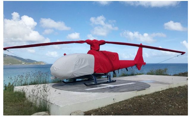
Aerospatiale AS341/342 Gazelle Full Cover Set