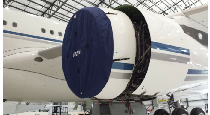
Airbus 340 Intake Covers