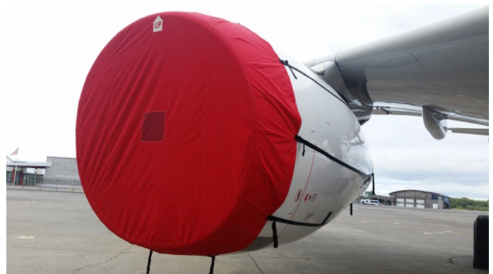
Airbus A330 Intake Cover, Trent 700 Engine