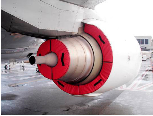
Boeing 737 Bypass and Exhaust Plugs

The Engine Exhaust Plugs are custom fit for your Airbus A330, A350 exhaust openings, made with heavy-duty vinyl material, and stuffed with a single block of sculpted urethane foam. Each plug has a zipper that allows the foam to be removed and dried if necessary. Exhaust plugs have 'remove before flight' streamers sewn onto the face of the plugs. Most plugs are imprinted with the aircraft registration number in black for an extra charge. Exhaust plugs may be inserted soon after flight when the engine is still warm. Engine Inlet Plugs are commonly referred to as Cowl Plugs, Intake Plugs, Cowl Blocks, Engine Blocks, and Engine Bungs.