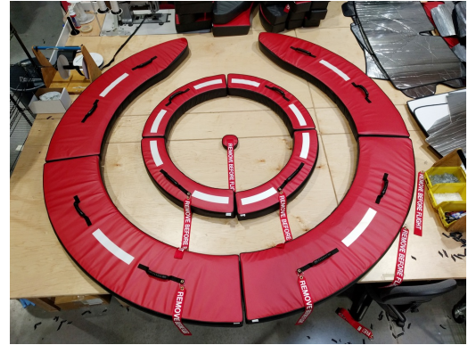
Boeing 747-8 Exhaust Plugs