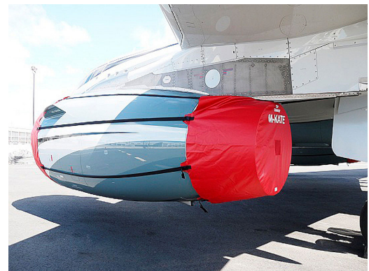
Airbus A319 Intake/Exhaust Covers set, IAE V2500