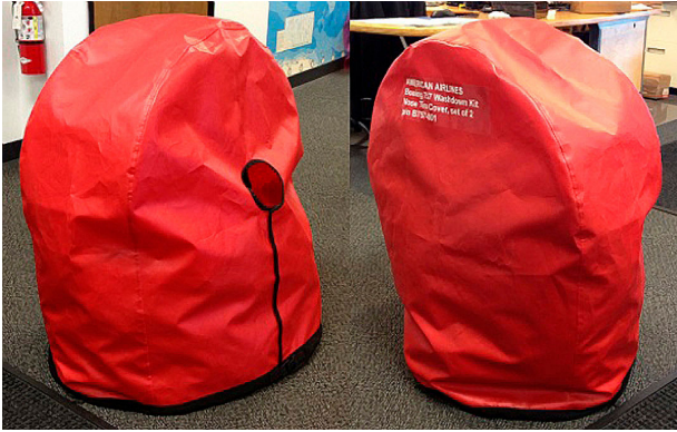
Boeing 757 Tire Covers, great for Wash Prep or Storage

ALL-YEAR USE MATERIAL - Made with Silver Acrylic Sunbrella canvas, the all-year use material is the best option for sun protection and cover longevity. This heavier more durable material is intended for all weather conditions, such as rain and snow or lots of sun.