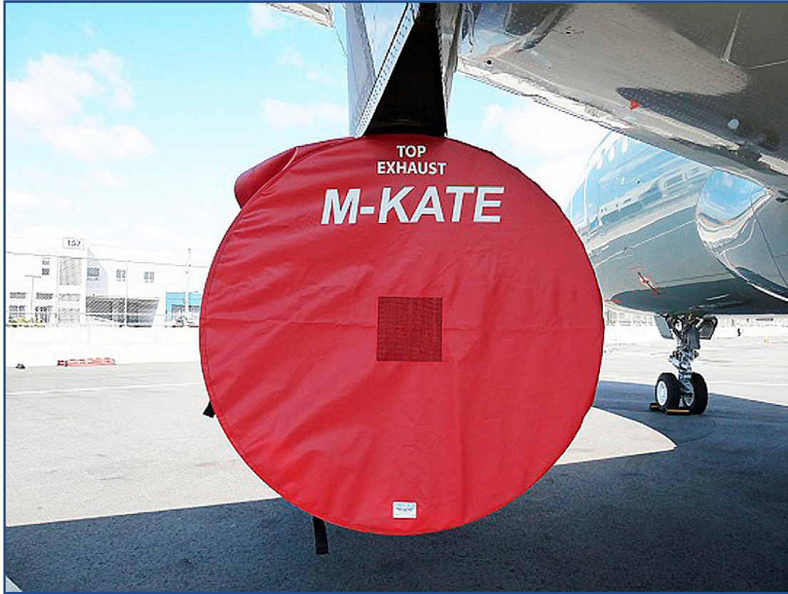
Airbus A319 Intake/Exhaust Covers set, IAE V2500