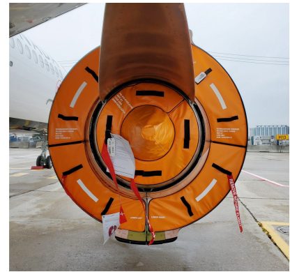
Airbus A320 Exhaust & Bypass Vent Plugs