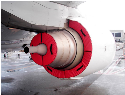
Boeing 737 NG Exhaust Plug Set, Folding Donut Ring Type

The Engine Inlet Plugs are custom fit for your Airbus A321 intakes, made with heavy-duty vinyl material, and stuffed with a single block of sculpted urethane foam. Each plug has a zipper that allows the foam to be removed and dried if necessary. Engine plugs have 'remove before flight' streamers sewn onto the face of the plugs. Most plugs are imprinted with the aircraft registration number in black for an extra charge. Storage bag NOT included. Engine plugs may be inserted after flight when the engine is still warm. Engine Inlet Plugs are commonly referred to as Cowl Plugs, Intake Plugs, Cowl Blocks, Engine Blocks, and Engine Bungs.