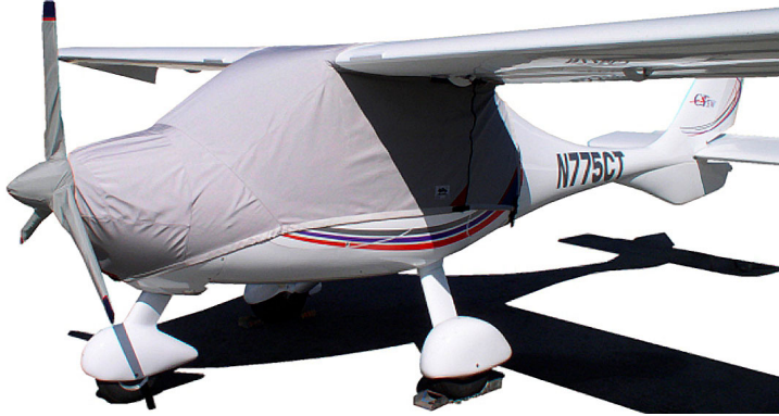
Flight Design CT Canopy/Engine Cover

This cover type is made from Silver Acrylic Sunbrella canvas and is 100% lined with a soft and smooth microfiber. Bruce's Custom Covers developed this material combination especially for aircraft protection. The outer material is medium weight and treated for water resistance, UV resistance and anti-static buildup. The inner lining is a very soft and smooth microfiber to prevent scratching. The material is very reflective, and tests show that the cabin interior temperature can be reduced to near-ambient temperature on the hottest of days. It is water, ice and snow repellent, yet breathable to allow moisture to escape from between the cover and the aircraft surface.