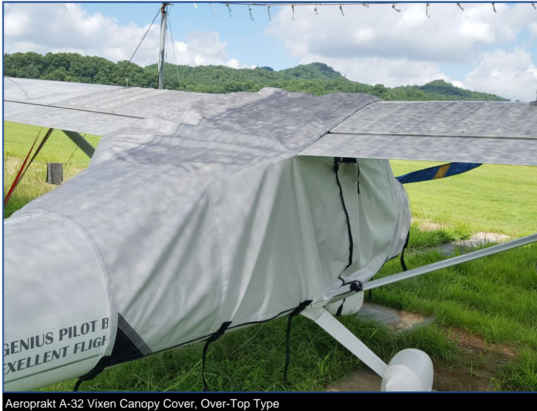
Aeroprakt A-32 Vixxen Canopy Cover, Over-Top Type