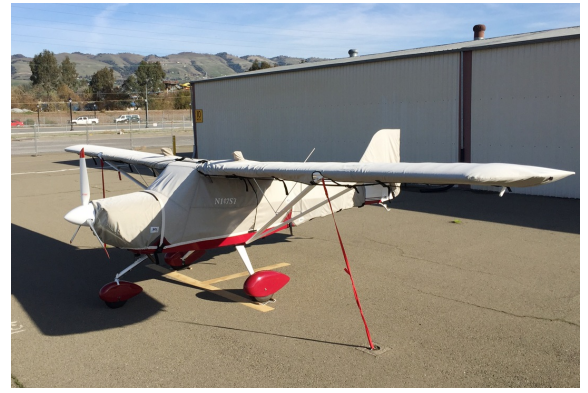
Eurofox Canopy, Engine, Wings and Empennage Covers