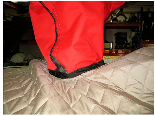
Alouette III Rotor Hub Cover, Insulated Engine/Transmission Cover Alouette III Rotor Hub Cover & Engine/Transmission Cover